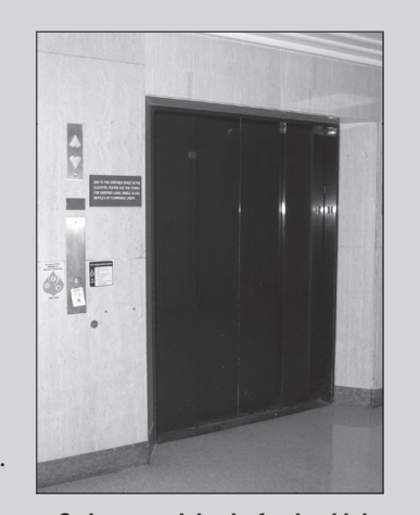
So long... and thanks for the ride!

repaired without major cost and time delay, so it will be replaced.