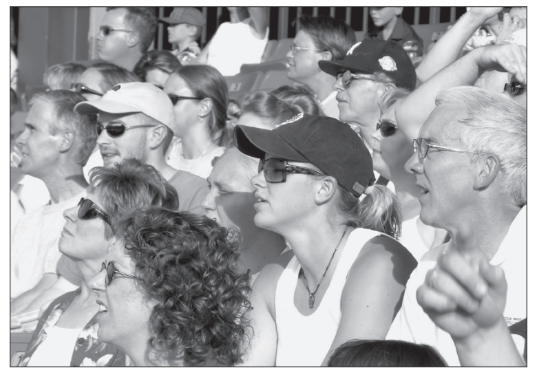
Fly Ball A group of Cubs fans try to follow a fly ball that was lost in the sun. See anyone you know?