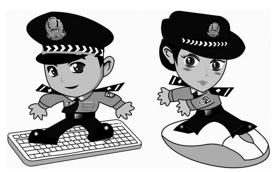
Images of "Jing-Jing" and "Cha-Cha" from a Web site of the Chinese Internet police. 48

The other side of China's Internet monitoring regime consists of public institutions and private sector companies. In a parallel to how the Chinese government conducts media censorship, private companies and other institutions operating inside China have adopted the use of their own Internet monitors, known colloquially as "big mamas." A "big mama" monitors the Web page of his or her own company or institution for material that might displease government censors. In this way, companies and institutions protect themselves from official displeasure, and the government enlists the resources of business, educational, and civil society groups to censor themselves.<sup>49</sup>