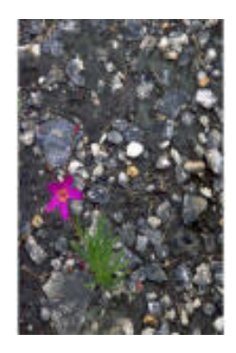
Echinacea tennesseensis (Tennessee coneflower)