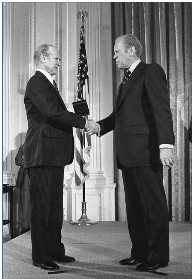
William H. Pickering receives the 1975 National Medal of Science from President Gerald R. Ford on 18 October 1976.

As a result of these efforts, many new, non-space-related projects ran in parallel with the ongoing NASA programs at JPL. These projects were funded, with NASA concurrence, by independent agencies. Projects in the fields of urban mass transportation, city government, education, law enforcement, and biomedics and solar energy are examples.