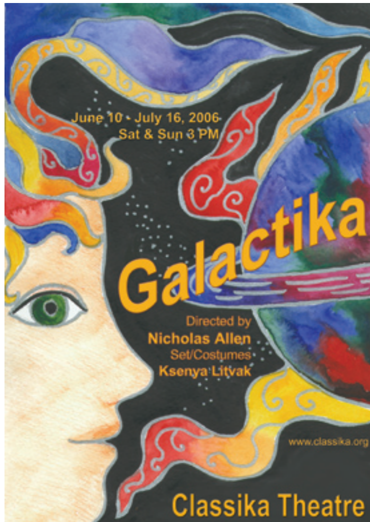
Caption Above: A Poster Advertising Galactika