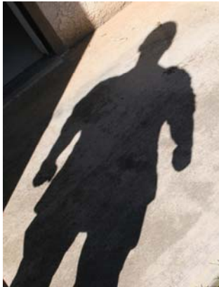
"The Shadow of Despair"

Welcome to Encampment! Today's activities began at 1000 hours with the start of in-processing.