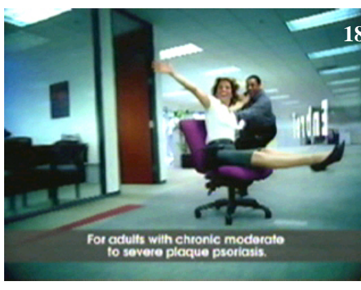
of treating moderate to severe