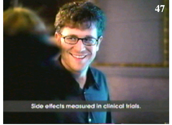
injection site reaction