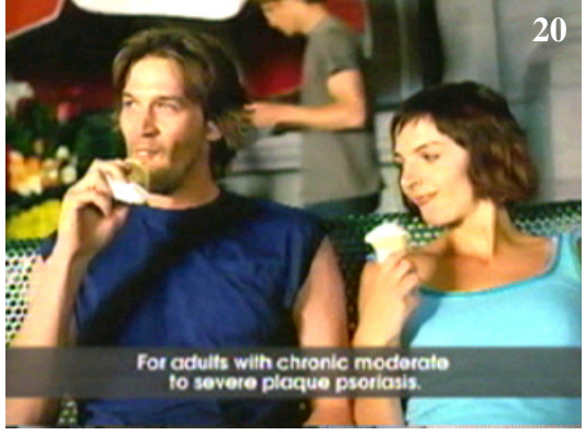
It can dramatically