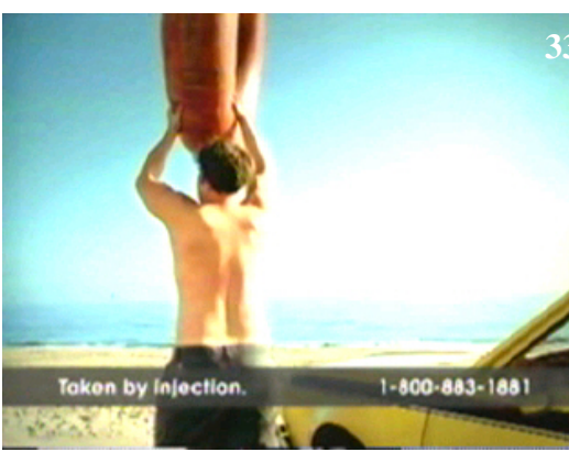
if you're prone to them or