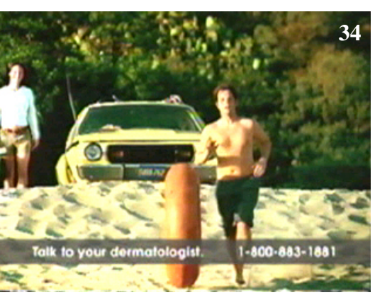
if you've been treated for