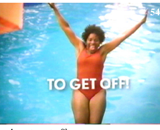
where to get off.