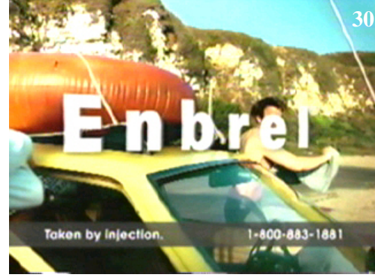
so don't start it