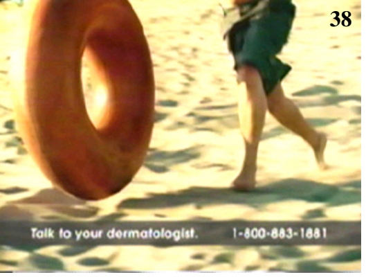
or paleness while