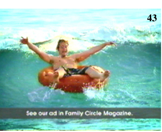
nervous system and