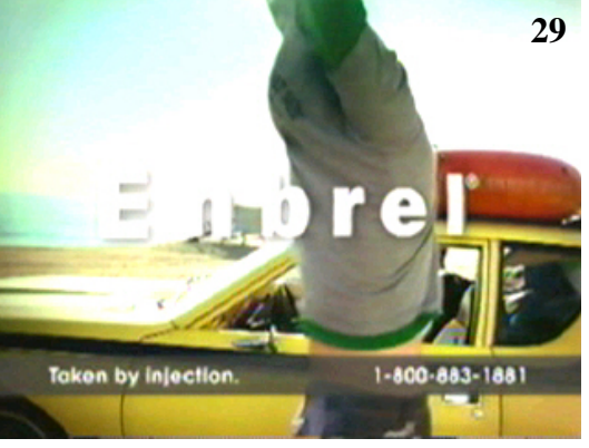
to fight infection