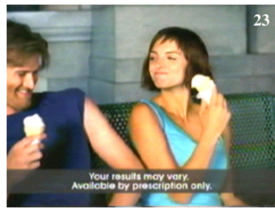
and help keep it clear... month