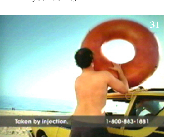
if you have one.