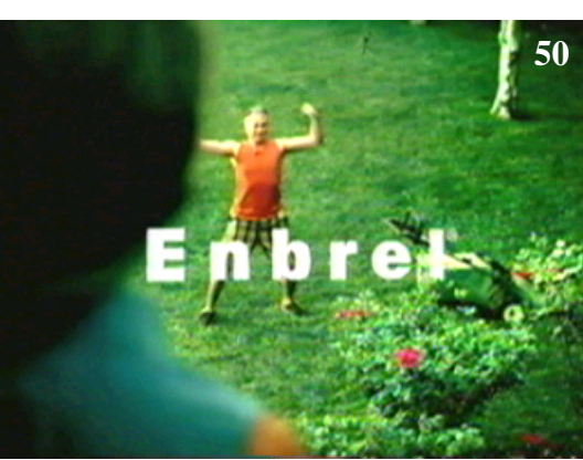
Ask your dermatologist