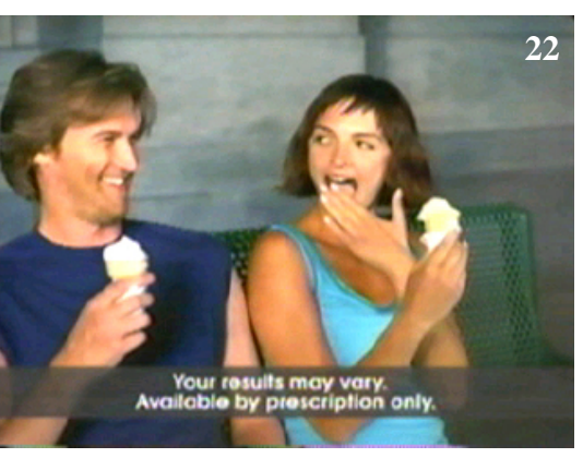
clear skin fast