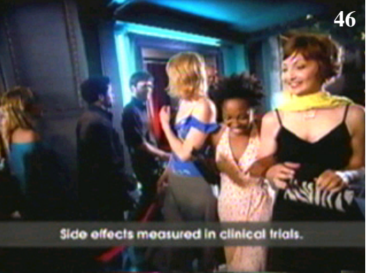
Common side effects included