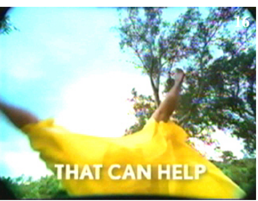
that can help.