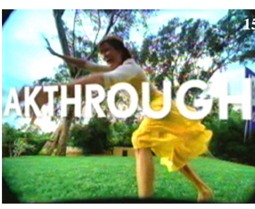
It's a breakthrough