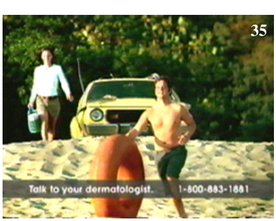
heart failure or if you experience