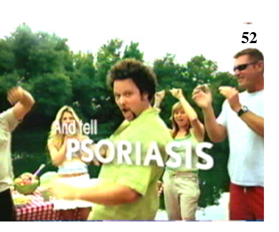
And tell psoriasis