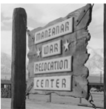
Adams, Ansel. "Entrance to Manzanar, Manzanar Relocation Center." Photograph. 1943. Library of Congress Prints and Photographs Online Catalog. http://hdl.loc.gov/loc.pnp/ppprs.00226

http://memory.loc.gov/cgi-bin/query/r?ammem/fsaall:@field(NUMBER+@band(fsa+8a31170))