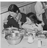
"Santa Anita reception center, Los Angeles County, California. The evacuation of Japanese and Japanese-Americans from West coast areas under United States Army war emergency order. Japanese family eating their first meal at the center. All meals are served in mess halls."

http://memory.loc.gov/cgi-bin/query/r?pp/fsaall:@field(NUMBER+@band(fsa+8c25077))