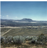
Lee, Russell. "Japanese-American camp, war emergency relocation, Tule Lake Relocation Center, Newell, Calif." Photograph. 1942 or 1943. Library of Congress Prints and Photographs Online Catalog. http://hdl.loc.gov/loc.pnp/fsac.1a35016