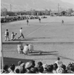
Adams, Ansel. "Baseball game, Manzanar Relocation Center, Calif." Photograph. 1943. Library of Congress Prints and Photographs Online Catalog. http://hdl.loc.gov/loc.pnp/ppprs.00369