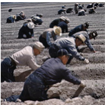
Lee, Russell. "Japanese-American camp, war emergency evacuation, [Tule Lake Relocation Center, Newell, Calif.]" Photograph. 1942 or 1943. Library of Congress Prints and Photographs Online Catalog. http://hdl.loc.gov/loc.pnp/fsac.1a35013