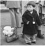
"Los Angeles, California. Japanese-American evacuation from West Coast areas under U.S. Army war emergency order. Japanese-American child who will go with his parents to Owens Valley." Photograph. April 1942.

http://memory.loc.gov/cgi-bin/query/r?ammem/fsaall:@field(NUMBER+@band(fsa+8a31170))