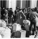
Lange, Dorothea. "Residents of Japanese ancestry awaiting the bus at the Wartime Civil Control sta., San Francisco, Apr. 1942." Photograph. April, 1942. Library of Congress Prints and Photographs Online Catalog. http://hdl.loc.gov/loc.pnp/cph.3a25601

http://memory.loc.gov/cgi-bin/query/r?ammem/fsaall:@field(NUMBER+@band(fsa+8a31204))