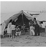
"Nyssa, Oregon. FSA (Farm Security Administration) mobile camp. Ordinarily electricity is not supplied to the tents of migrant families living in the FSA camps. These Japanese-Americans, who were accustomed to better living conditions, wanted the electricity..." Photograph. July 1942.

http://memory.loc.gov/cgi-bin/query/r?pp/fsaall:@field(NUMBER+@band(fsa+8c25077))