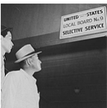
"Japanese enlistment. These Americans of Japanese ancestry are about to enter their draft board at Waipahu, Territory of Hawaii, to apply for voluntary induction into the U.S. Army." Photograph. March 1943.