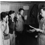
U.S. Army Corps. "Kauai District, Territory of Hawaii. Major Charles V. McManus administering the oath to four AJA volunteers." Photograph. March 1943. Library of Congress Prints and Photographs Online Catalog. http://hdl.loc.gov/loc.pnp/fsa.8e02434