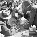
"Santa Anita reception center, Los Angeles, California. The evacuation of Japanese and Japanese-Americans from West Coast areas under U.S. Army war emergency order. Registering Japanese-Americans as they arrive." Photograph. April 1942.

http://memory.loc.gov/cgi-bin/query/r?ammem/fsaall:@field(NUMBER+@band(fsa+8a31204))