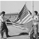
"Rupert, Idaho. Former CCC (Civilian Conservation Corps) camp now under FSA (Farm Security Administration) management. Japanese-Americans taking down their flag in the evening." Photograph. July 1942.