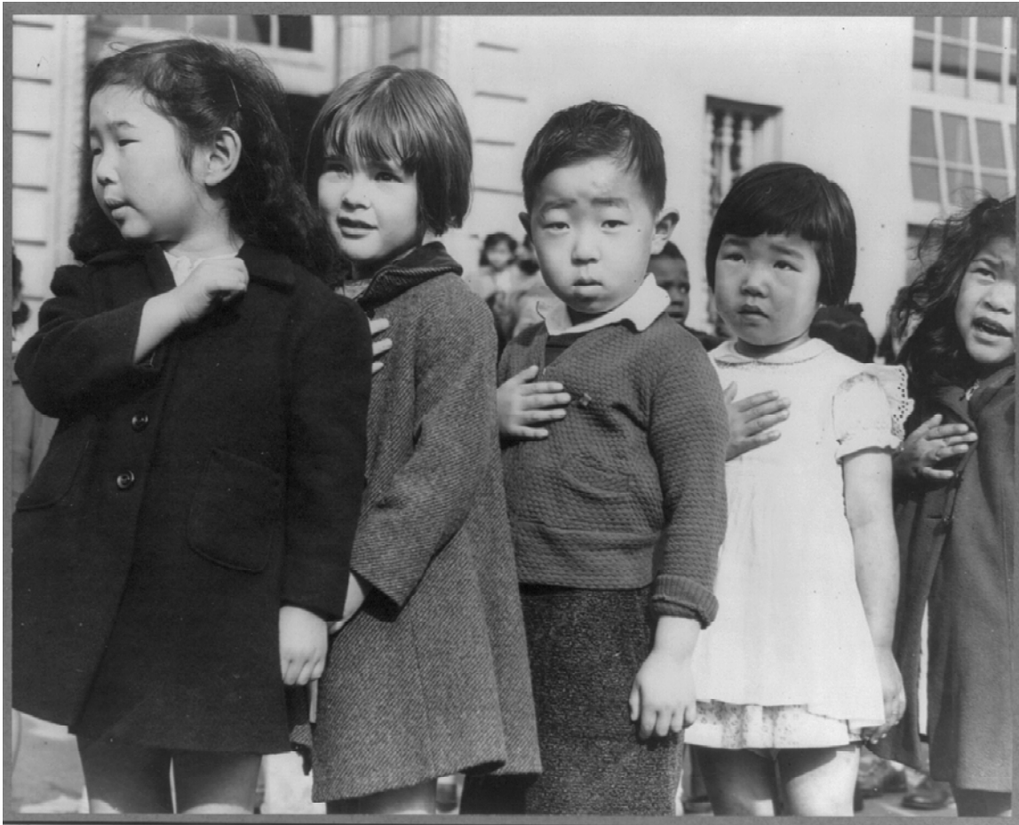
[Children pledging allegiance to U.S. flag at Weill public school, San Fran., prior to relocation] http://hdl.loc.gov/loc.pnp/cph.3a43126

Question: What is one thing you would like everyone to know about Japanese American internment.?