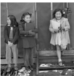
Adams, Ansel. "School children, Manzanar Relocation Center, California." Photograph. 1943. Library of Congress Prints and Photographs Online Catalog.

http://memory.loc.gov/cgi-bin/query/r?ammem/fsaall:@field(NUMBER+@band(fsa+8c24471))