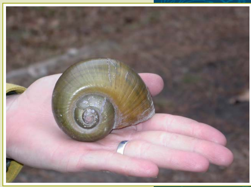
Invasive Channeled apple snail

The construction of dams and impoundments (from agricultural ponds to large reservoirs) can alter stream flows and water temperatures and create barriers to dispersal of fish and other aquatic species. Many of Georgia's imperiled aquatic species are vulnerable to habitat degradation and fragmentation resulting from man-made impoundments.