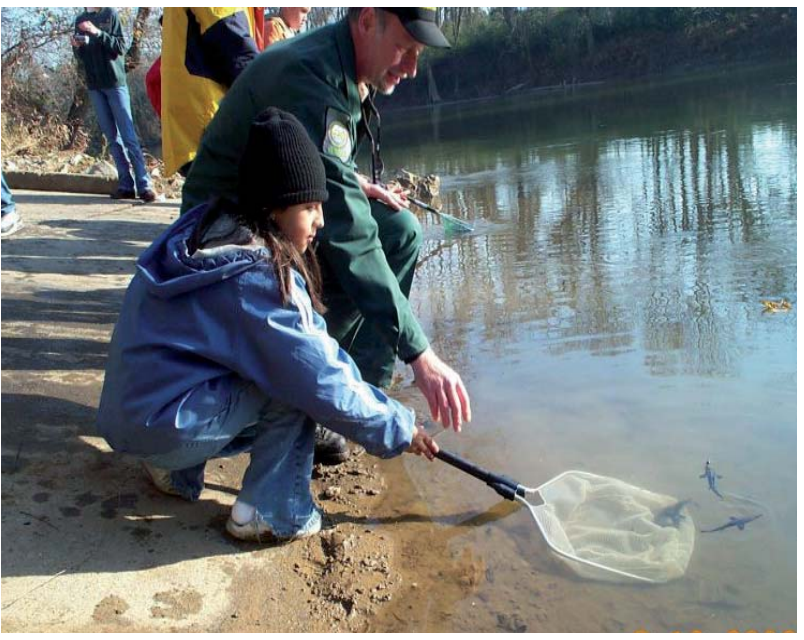
Stocking Lake Sturgeon

The Georgia Wildlife Action Plan was developed with input from a wide array of public and private agencies and organizations. A steering committee composed of representatives of state and federal agencies, private conservation organizations, and private landowners provided guidance for the planning effort. An interagency committee, first convened in November 2005, is facilitating the implementation of the plan. Like the steering committee, the implementation committee includes representatives from a broad range of