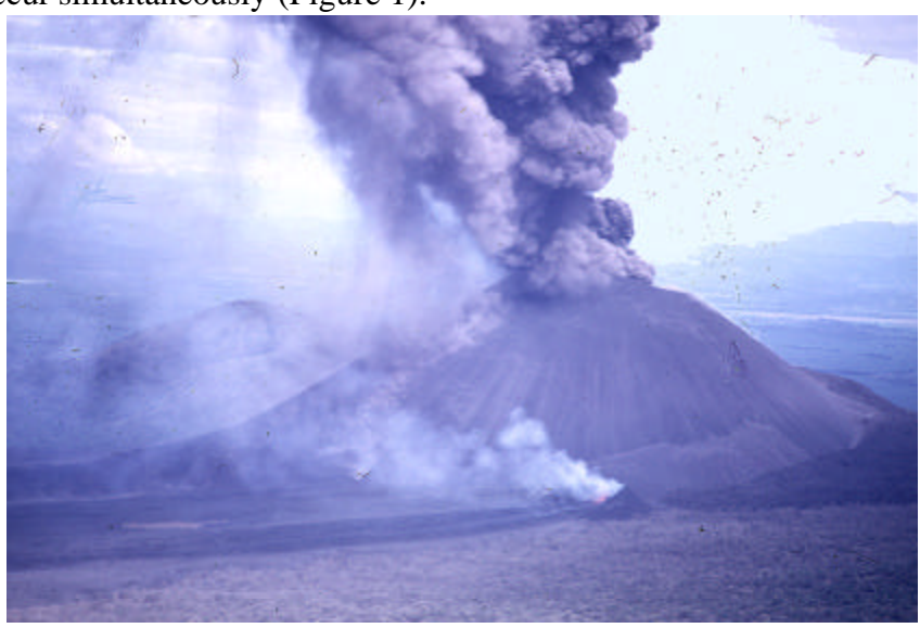
Figure 1. 1968 Strombolian eruption of Cerro Negro Volcano, Nicaragua. In the foreground is a small crater that is emitting fire fountains that are feeding a lava flow during the central crater's Strombolian eruption. Diameter of base is about 1.5 km.

Lava fountaining is a typical part of Strombolian eruptions, driven to by rising magma that is rapidly expanding as gases, again mainly water, exsolve due to drop on pressure in the rising magma column. At times, both degassed lava and Strombolian eruptions occur simultaneously (Figure 1).