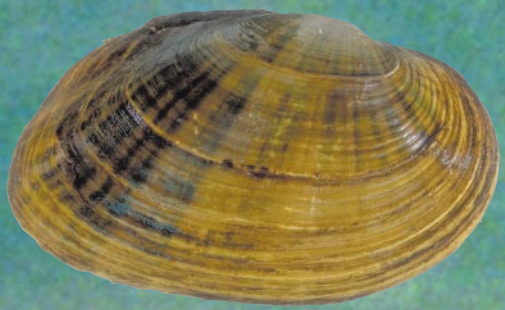
Mucket Actinonaias ligamentina