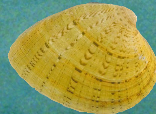
Butterfly Ellipsaria lineolata