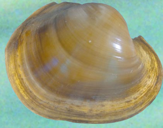
Fat pocketbook Potamilus cupax