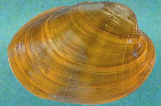
Higgins eye Lampsilis higginsii