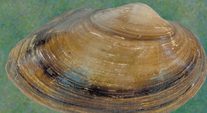
Giant floater Pyganodon grandis