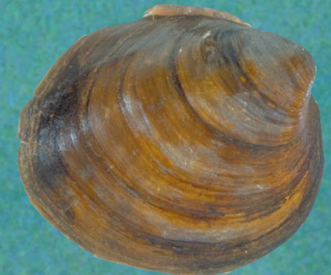
Ebonyshell Fusconaia ebena