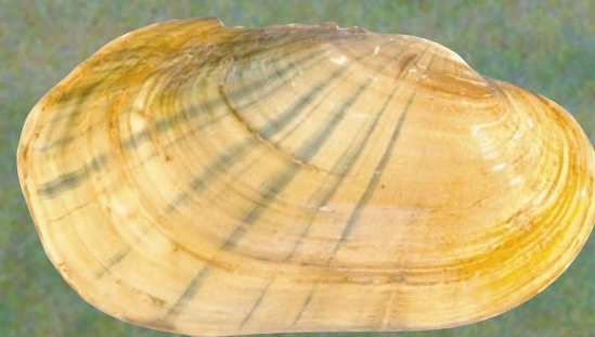
Fatmucket Lampsilis siliquoidea