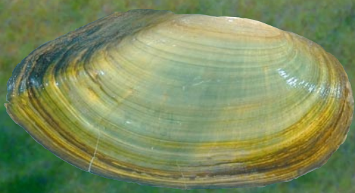
Paper pondshell Utterbackia imbecillis