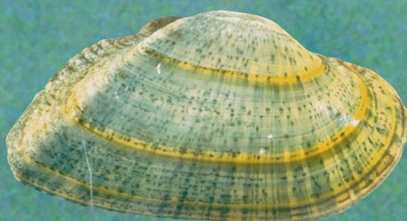
Elktoe Alasmidonta marginata