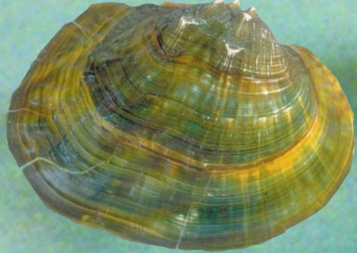
Rock pocketbook Actinonaias confragosa