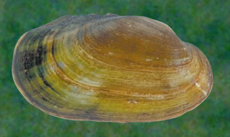
Lilliput Toxolasma parvus