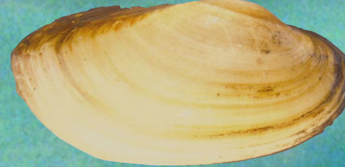
Yellow sandshell Lampsilis teres