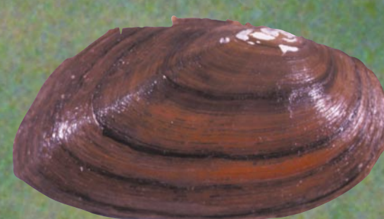
Eastern elliptio Elliptio complanata