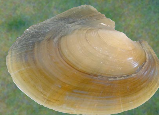
Pink papershell Potamilus ohioensis