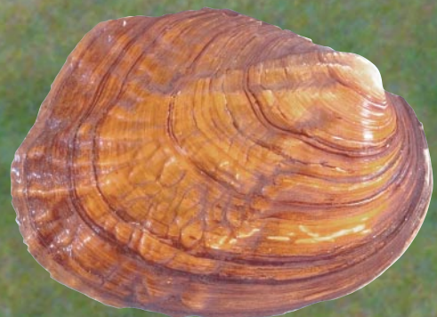
Threeridge Amblyma plicata