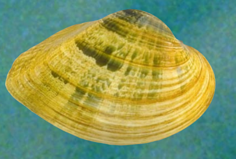
Snuffbox Epioblasma triquetra