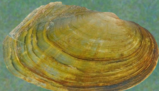
Creek heelsplitter Lasmigona compressa