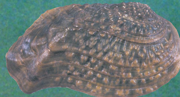
Pistolgrip Tritogonia verrucosa