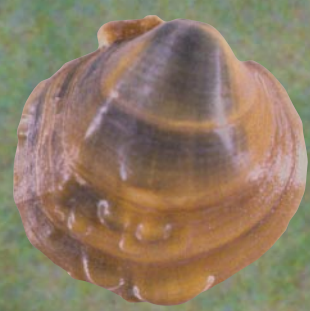
Pimpleback Quadrula pustulosa