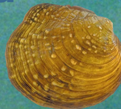
Purple wartyback Cyclanaias tuberculata