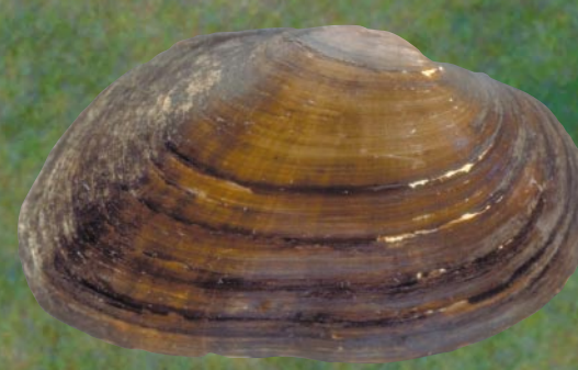
Strange floater Strophitus undulatus