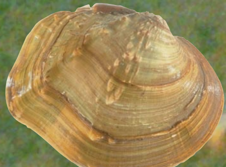
Mapleleaf Quadrula quadrula