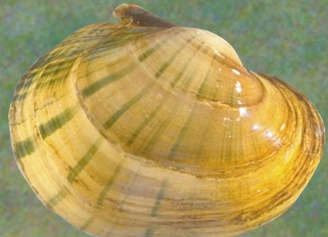
Plain pocketbook Lampsilis cardium