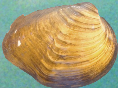
Sheepnose Plethobasus cyphus