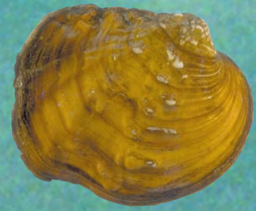
Winged mapleleaf Quadrula fragosa