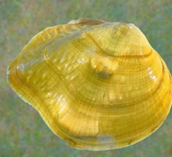
Threehorn wartyback Obliguaria reflexa