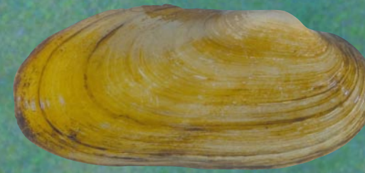
Salamander mussel Simpsonia ambigua