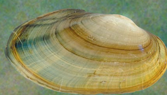
Cylindrical papershell Anodontoides ferussacianus