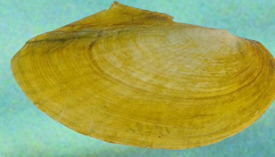
Scalleshell Leptodea leptodon