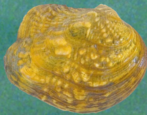
Monkeyface Quadrula metanevra