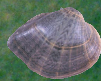
Deertoe Truncilla truncata