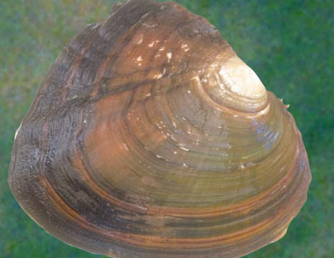
White heelsplitter Lasmigona complanata