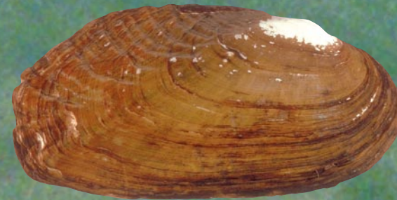
Fluted-shell Lasmigona costata