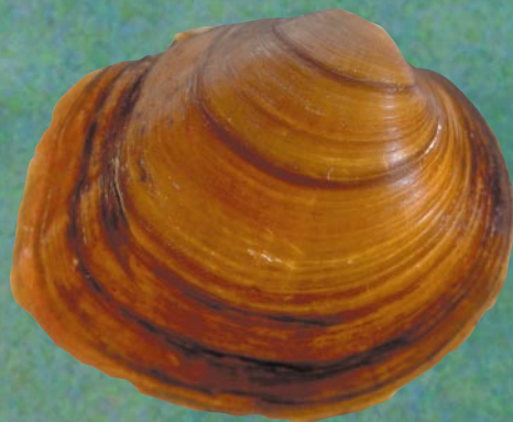
Round pigtoe Pleurobema coccineum