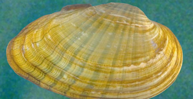
Ellipse Venustaconcha ellipsiformis