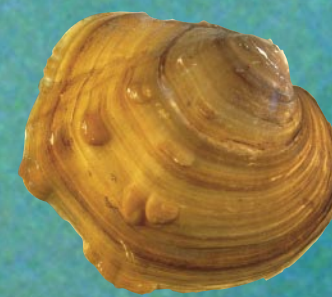
Wartyback Quadrula nodulata