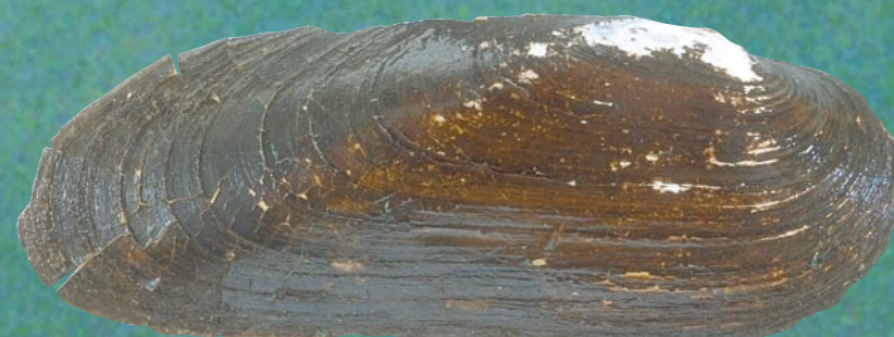
Spectaclecase Cumberlandia monodonta