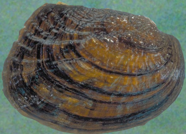
Washboard Megalanaia nervosa