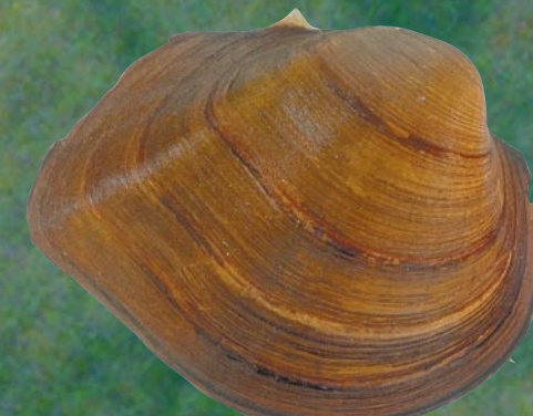
Wabash pigtoe Fusconaia flava