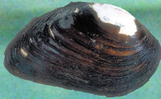
Elephant-ear Elliptio crassidens