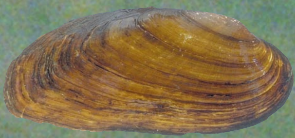
Spike Elliptio dilatata