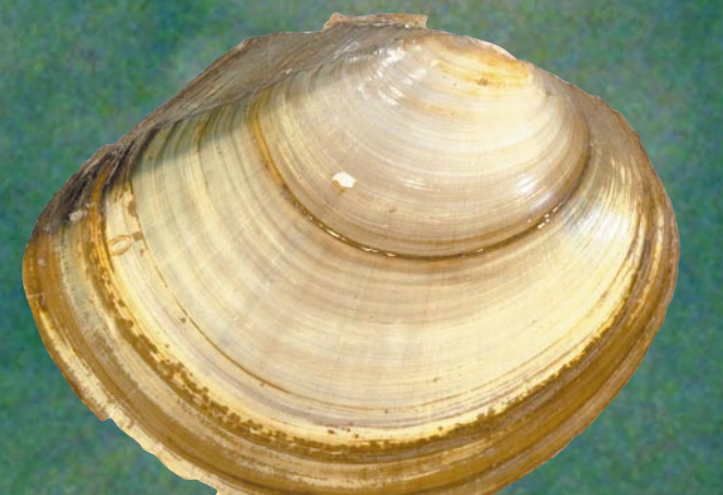
Flat floater Anodonta suborbiculata