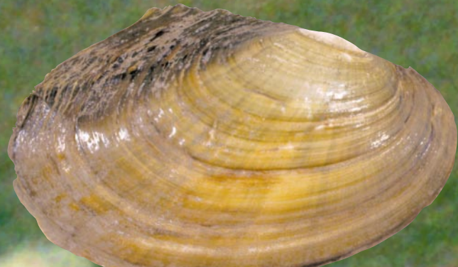
Fragile papershell Leptodea fragilis