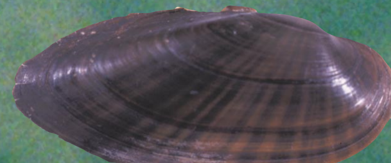
Black sandshell Ligumia recta