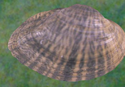
Fawnsfoot Truncilla donaciformis