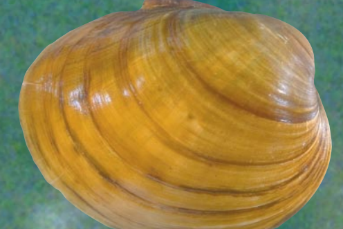
Hickorynut Obovaria olivaria