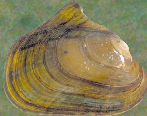
Pink heelsplitter Potamilus alatus