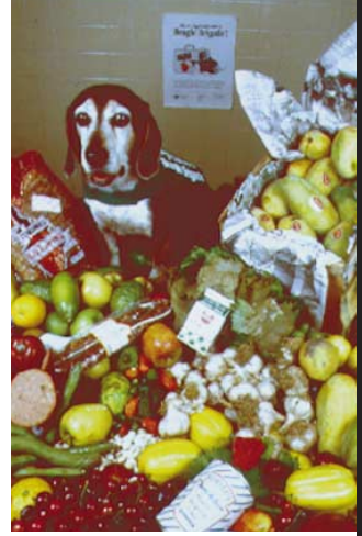
Jackpot I was one of the Beagle Brigade's first and best known detector dogs. He is pictured with a day's worth of contraband from John F. Kennedy International Airport, NY.

Beagles are among the healthiest of all dog breeds. They are considered the "Eagle Scouts" of dogs. Loyal, courageous, obedient, and patient, beagles travel well and are equally at home indoors and outdoors. Because of their curiosity, intelligence, high response to food, and superior sense of smell, beagles emerged as the obvious choice to be used for APHIS' detective work.