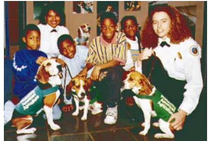
Beagle Brigade teams are often called upon to educate people about USDA and its role in protecting American agriculture.

Teamwork is important in the Beagle Brigade. PPQ canine officers are responsible for conducting continuing training programs for their detector dogs as well as for the general well-being of the dog on and off the job. The canine officer completes required data-gathering procedures and submits appropriate reports. The Beagle Brigade is also part of the larger APHIS team that protects American agriculture. The PPQ canine officers are expected to play an active role organizing opportunities to get the larger APHIS message out to the public.