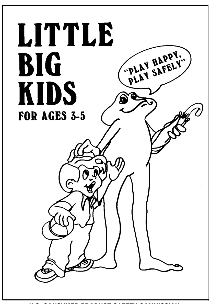
U.S. CONSUMER PRODUCT SAFETY COMMISSION WASHINGTON, D.C. 20207