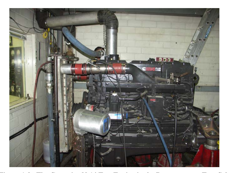
Figure 1-2. The Cummins N-14 Test Engine in the Dynamometer Test Cell

The diesel engine used in the test program was a Cummins N-14 370-HP turbocharged engine manufactured in 1996 (Figure 1-2). This engine was selected for testing because it represents a large segment of heavy-duty diesel engines currently on the road for which the Condensator technology is intended. Prior to the start of testing (January 21, 2005), a Cummins technician inspected the engine in the test cell and verified that the engine was without mechanical problems and operating within its acceptable range of specifications.