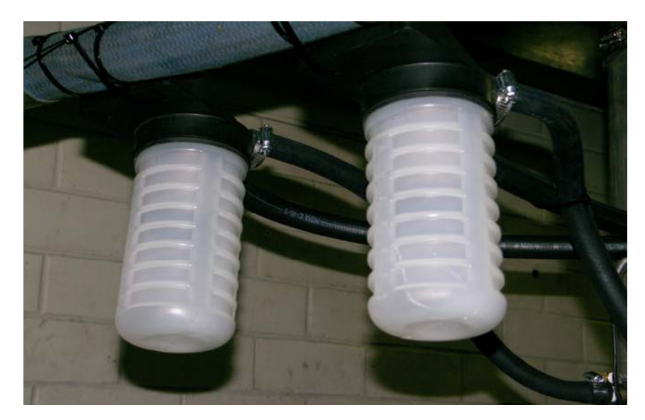
Figure 1-1. NCI Condensator on the Cummins N-14 Test Engine

According to NCI, crankcase exhaust comes in contact with silica bead separators in the Condensator, resulting in a molecular separation process where large, heavier oil molecules condense and collect in the Condensator containers. Water and acid present with the oil will also drop into the containers. Gaseous emissions, including hydrocarbons, continue through the system and are vented back into the engine air intake. Waste oil and condensate collected in the Condensator containers should be emptied during vehicle oil changes. This is done by unscrewing the container from the head and properly disposing of the waste. The separators are cleaned periodically in a solvent to dislodge and remove any carbon or sludge that may have attached to the silica beads. NCI states that this technology can provide the following benefits: