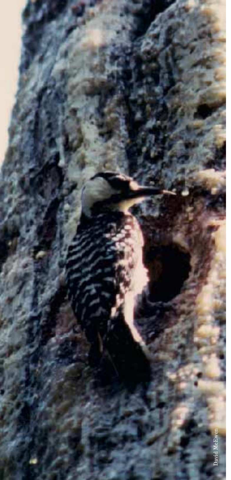
Wildlife Observation/ Photography