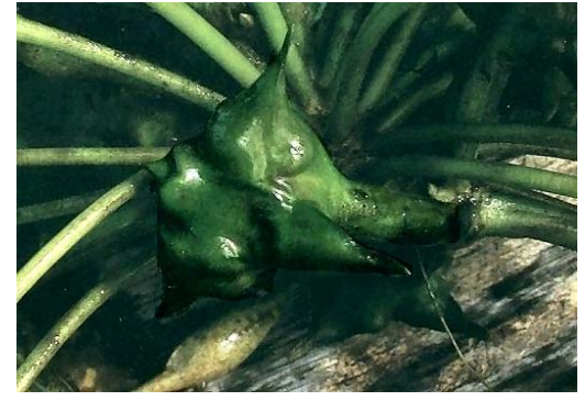
Mature, viable water chestnut seed with sharp spines.

Connecticut Dept of Environmental Protection: 860-424-3589 Maine Dept of Environmental Protection: 207-287-6110 Massachusetts Dept of Conservation and Recreation: 617-626-1411 New Hampshire Dept of Environmental Services: 603-271-2248 New York State Dept of Environmental Conservation: 518-402-8282 Rhode Island Natural History Survey: 401-874-5800 Vermont Dept of Environmental Conservation: 802-241-3777 Quebec Societe de la faune et des parcs du Quebec: 450-928-7607 ext. 270