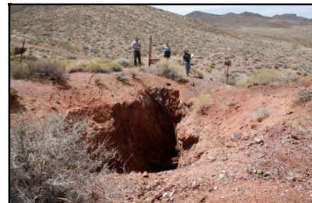
Visitors camp near this mine opening in the Greenwater Mining District.

We noted three open mine shafts at the Greenwater Mining District. Two of the shafts were well fenced; however, the third was easily accessible and posed a danger to park visitors. This shaft was several hundred feet deep and within close proximity to an area where visitors had been camping. A fence around this mine shaft was dilapidated and was not effective in keeping visitors away from the “ant-trap”-like opening.