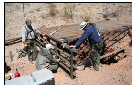
NPS personnel from Joshua Tree National Park installing a prefabricated cover at Lake Mead.

At Joshua Tree National Park, NPS has the capabilities to mass produce prefabricated mine covers and gates. This enables a large number of sites to be mitigated economically and efficiently. We believe this approach is a good model that could be expanded within NPS and adopted by BLM.