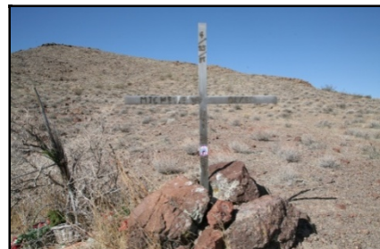
Site near Beatty, NV, where a young girl fell to her death in an open shaft.

More recently, in 2007, near BLM's Windy Point Recreation Area, Kingman, AZ, a young girl was killed after falling into an open abandoned mine. The girl and her sister were riding an all-terrain vehicle, ran off a trail, and fell into a 125-foot mine shaft. The sister was seriously injured and spent the night in the mine before being rescued. The shaft is on a small privately owned parcel surrounded by BLM property. BLM maintains a nearby campground and a road leading to the area where the death occurred. A barbed-wire fence, provided by BLM, and warning signs were erected around the abandoned mine shaft shortly after the accident.