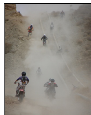
Off-road vehicle trail on contaminated tailings in Randsburg, CA.

In March and May 2007, we visited the Rand Mining District near Ridgecrest, CA, because soil samples taken by BLM in 2006 identified dangerous levels of arsenic contamination thousands of times higher than Environmental Protection Agency (EPA)-recognized safe levels. BLM had known about this potential contamination for decades but had never taken samples to assess the danger to the public. We confirmed these serious environmental hazards and also found numerous physical safety hazards. These hazards were endangering the residents of Randsburg and Red Mountain as well as thousands of off-road vehicle recreationalists who routinely visit the area. BLM estimates that costs to mitigate environmental and safety hazards in the District could exceed $170 million. Due to the potential risks to the public, we issued Flash Report No. C-IN-BLM-0012-2007, “Environmental, Health and Safety Issues at Bureau of Land Management, Ridgecrest Field Office, Rand Mining District, CA.”