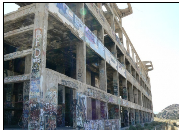
Dilapidated mill building at American Flat Mill.

In July 2007, we visited the American Flat Mill site, located near the town of Virginia City, NV, where a teenager died climbing the stairs on his all-terrain vehicle. The mill is a large, two-story, dilapidated concrete structure where ore was processed in the 1920s using cyanide. The site is an extremely dangerous physical safety hazard. It is easily accessible, with few fences, and is a popular "party" hangout for local teens. Most of the structure has no outside walls and there are large holes in the floors that could easily result in a serious injury or death.