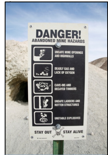
Warning sign that could be used as a minimum precaution at abandoned mine sites.

The findings from this audit paint a picture of compelling urgency, which should trigger a swift call to action by both the Department and Congress. We are providing recommendations designed to help develop a comprehensive solution to this multi-faceted problem, not of DOI's making, but now, certainly, in the Department's realm of responsibility.