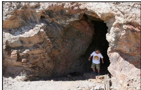
Young boy exiting a mine adit with a collapsing roof in Death Valley National Park. (OIG Photo)