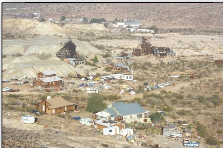
Residents and businesses in trespass in Red Mountain, CA, near mine tailings.

Historical trespass on BLM land is known to exist at many locations throughout the West, according to a BLM official. This trespassing includes commercial activities and residential development on abandoned mine sites on federal land. Two of the abandoned mine sites we visited had residential and commercial development in areas with safety and potential environmental hazards. This residential and commercial trespass hinders BLM's efforts to mitigate sites because of the regulatory and legal delays associated with evicting trespassers and physically removing homes and commercial facilities.