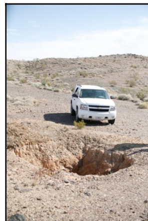
Dangerous mine shaft at the Johnny Shaft site.

At two sites, we found mine shafts on roads that were large enough to easily swallow entire vehicles. In both cases, there were no fences or signs warning the public of the danger. At the Gold Cycle site in the preserve, a ladder going into the mine provided easy access to the mine shaft. At the Johnny Shaft site, we observed that the road led directly to a mine with a 400-ft deep shaft.