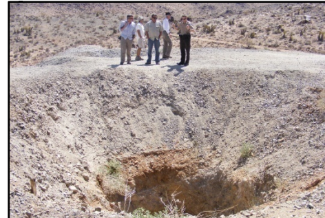
Open mine shaft at the Goat Basin Mine where a visitor died.

In 1991, a visitor to the Goat Basin Mine, Barstow Field Office, CA, bypassed a fence around an open mine shaft and attempted to lower himself into the shaft using chains attached to the bumper of his truck. The chains slipped and he fell 200 feet to his death. This type of site is commonly called an "ant trap" because it has steeply sloping sides that prevent escape if a person begins to slide into the shaft. After the accident, BLM did install a barbed wire fence around the shaft; however, during our site visit, we saw only remnants of the fence and no warning signs. This site was not on BLM's abandoned mine inventory and was not effectively mitigated.