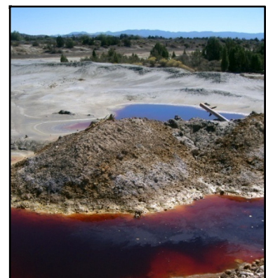
Acidic pond at Caselton Tailings site