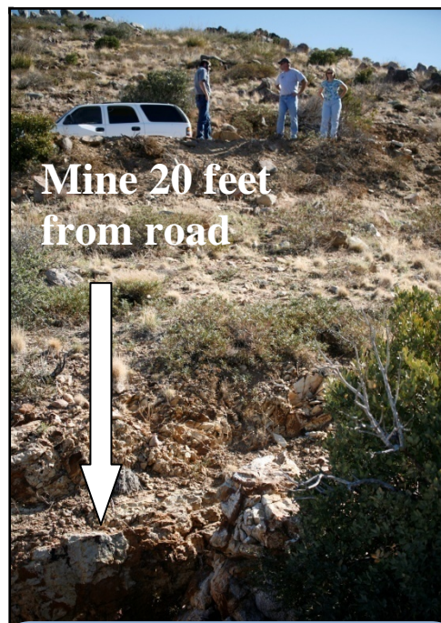
Dangerous mine shaft next to BLM-maintained road near Kingman, AZ. This shaft was a short distance from a similar hazard where a young girl died in September 2007.

At another mine northeast of Kingman, the COD Mine, we found physical and potential environmental hazards. The private land owner who lived directly below the mine believed his well water was contaminated by the COD Mine. BLM contacted the mine claimant, who owned the mineral rights, several times in 2005 to notify him of site conditions, including abandoned