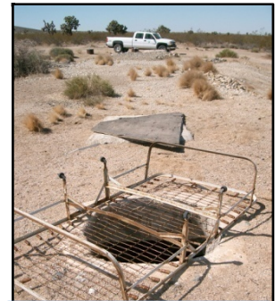
Open shaft near Barstow.