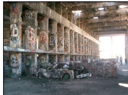
American Flat Mill where teen died riding an all-terrain vehicle.

In 1996, at the American Flat Mill near Virginia City, NV, a teenager died while climbing stairs on his all-terrain vehicle inside the structure. This extremely dangerous, dilapidated structure, which was built in the 1920s, is easily accessible with few fences and is a popular hang-out site for teens. While not documented, a BLM official told us that many other serious injuries have occurred at the site requiring flight-for-life helicopter rescues. BLM has not permanently mitigated the site because of concerns about the mill's "historical value."