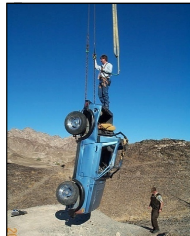
Vehicle being hoisted from a mine shaft on BLM land.

We found that NPS has mitigated many of its high-risk, easily accessible abandoned mine sites; however, there are hundreds, if not thousands, of sites that still need to be addressed. At one park, the abandoned mine inventory includes over 600 sites, and NPS officials have inspected less than half of the sites on the 1.4 million acres comprising the park. While NPS has a more effective program, current funding for NPS' abandoned mines program is inadequate to address these hazards, and NPS has failed to develop a credible estimate of the total cost of mitigation.