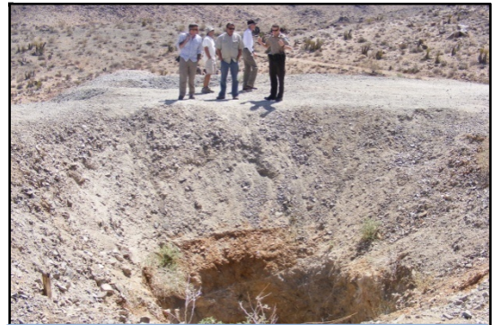
Open mine shaft at the Goat Basin Mine where a visitor died.

Visible mine tailings have migrated down the surface of Caselton Wash (a seasonal waterway that flows only during rains) toward Meadow Valley Wash to within about 3 miles of the town of Panaca and local water wells. An engineering evaluation conducted on the Caselton tailings stated that a catastrophic release of tailings could "severely and intensively impact water quality in Meadow