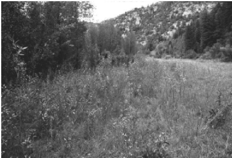
Figure 1. Repeat photos, 1996 and 2001, of photo-point 96-1 at Warm Springs Bottom (003) permanent monitoring transect 98SD003C. The arrows point to matching landmarks.