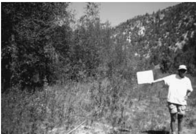
Photo-point 96-1 taken on August 28, 2001. Note the lack of mesic graminoid cover, barren sandy soil, and lack of Elaeagnus commutata shrubs.