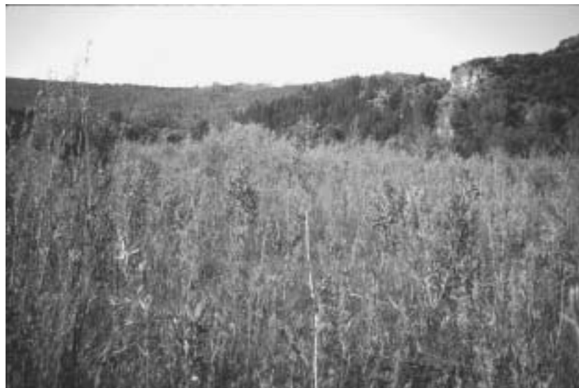
Figure 2. Photo-point at start of the Black Canyon (022) permanent monitoring transect (01SD022A), looking toward the end (taken on August 16, 2001).

Repeat Photography: Photos were taken on August 16, 2001. The photos are the same as those taken for the habitat change monitoring transect (Murphy 2001). Photos were taken both at the start and end of the transect, looking up and down the line. Figure 2 is a photo of the habitat looking from the start to end of transect 01SD022A. Unfortunately, photos of the habitat were not taken in 1999 or 2000.