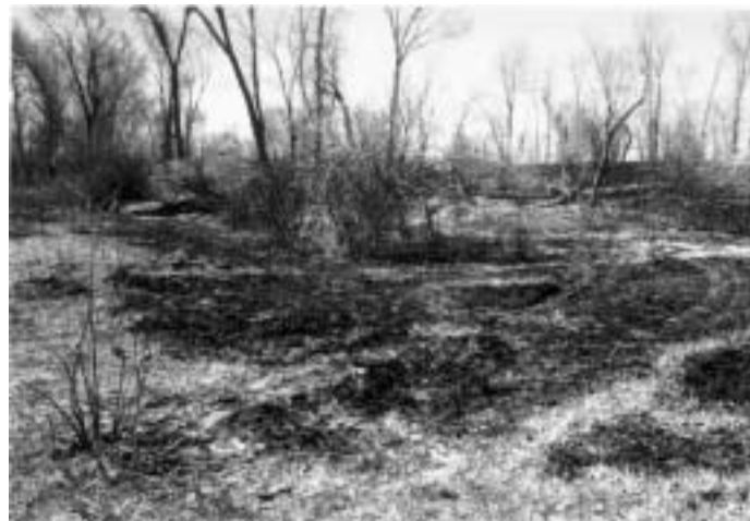
Figure 3. Annis Island (006) on June 6, 2001. Showing recent fire effects in Spiranthes diluvialis habitat. Note tracks from firefighting vehicle.