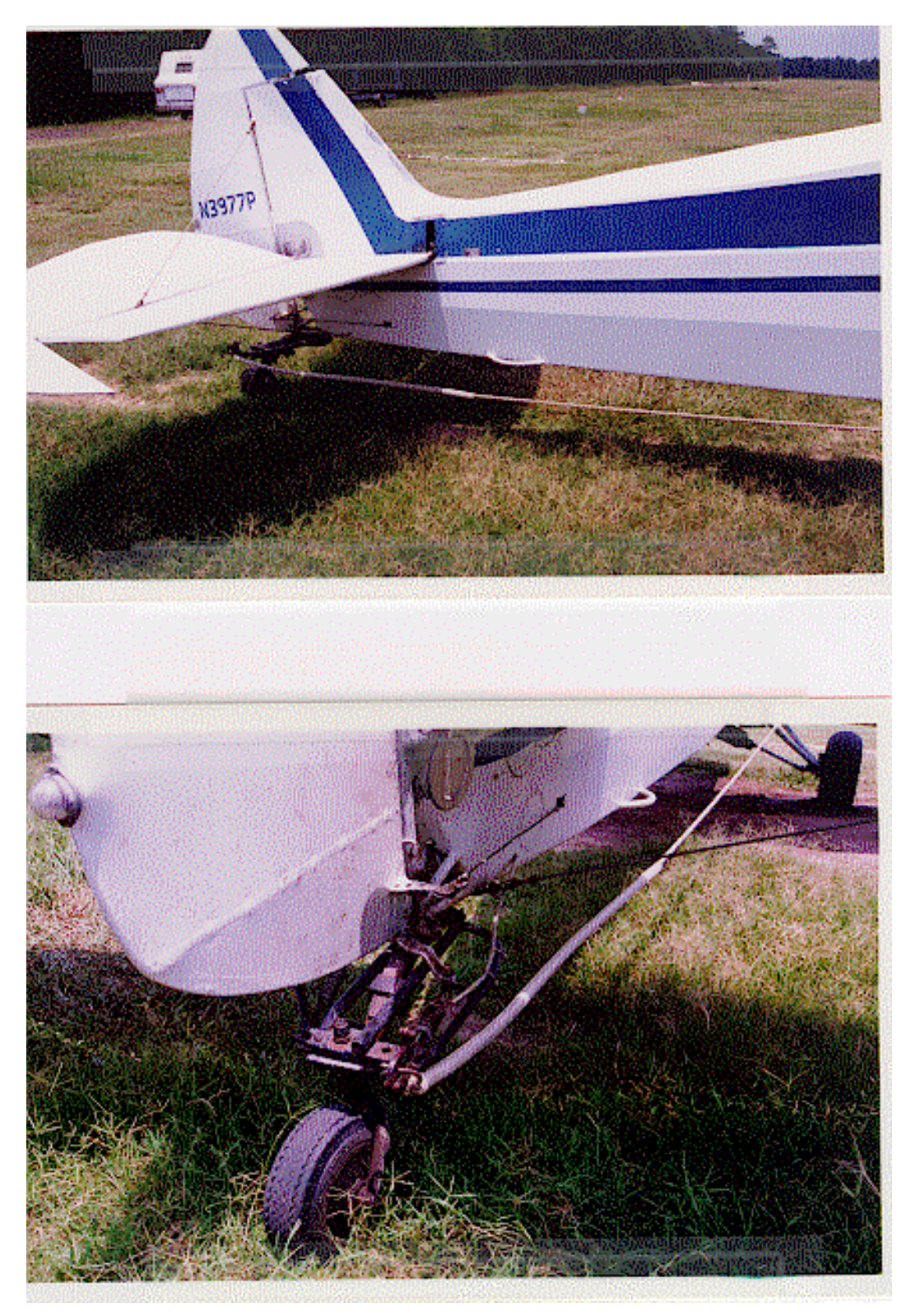
FIGURE 2-1. EXAMPLES OF A PLASTIC GARDEN HOSE INSTALLATION