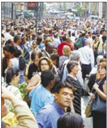
DARK VICTORY: New Yorkers calmly mingle after the blackout of 2003.

—ARLINGTON COUNTY FIRE CHIEF EDWARD PLAUGHER