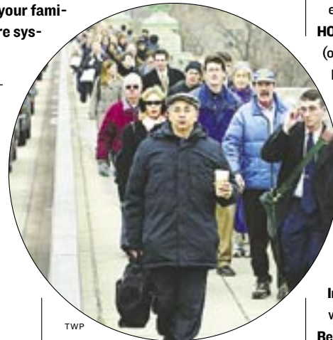
TWP Commuters file down Connecticut Avenue after a Red Line fire in March.

(also serves Montgomery County) Prince George's Hospital Center, Cheverly www.dimensionshealth.org/pghc.shtml