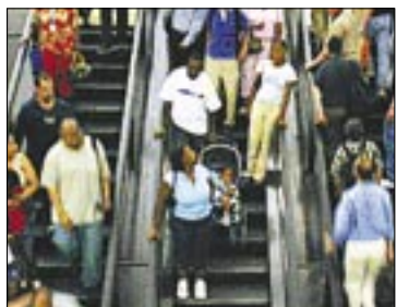
During an emergency, station managers can set the escalators to "up."

Most likely they will be open. If an alarm inside a station is triggered by smoke or heat, the fare gates will open automatically. The gates also will open on their own during a power outage. The station manager can open all the gates from the kiosk; he can switch the escalators so most or all run upward as well.