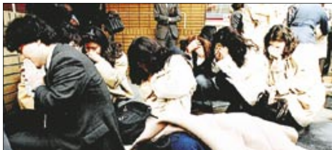
Tokyo commuters react to a sarin gas attack on the subway in March 1995.

Different emergencies require different responses. Know how to react and what to expect.