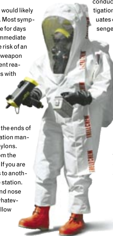
A Fairfax County firefighter wields chemical and radiation detectors.

More than likely, you're not going to be allowed off the train or out of the station because you could contaminate others. The area will be quarantined while a HAZMAT team sent by the jurisdiction's fire and EMS department conducts an investigation and evaluates each passenger. Then it's decontamination time.