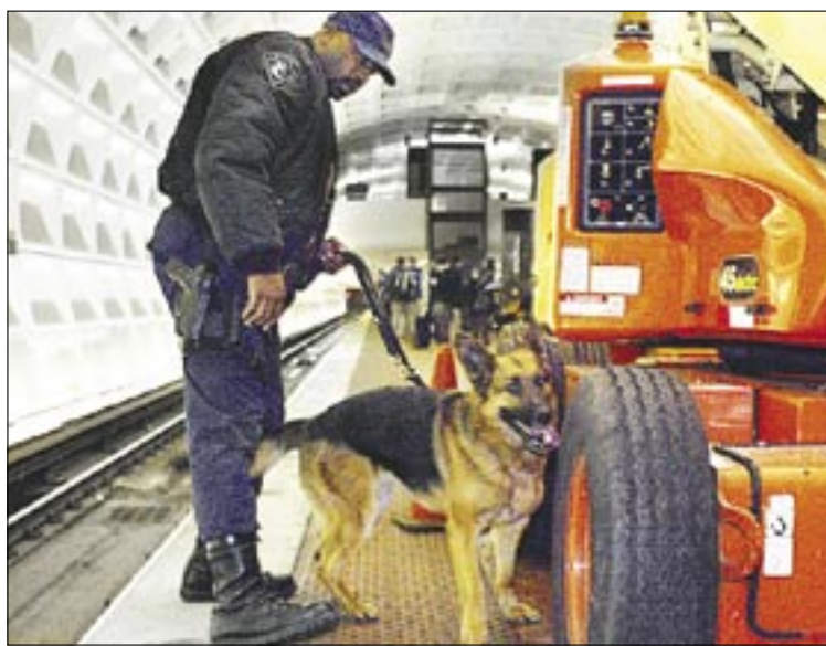
DOG DETAIL: A Metro Transit policeman patrols Farragut North with Kodo the dog.

Observation. The Metro system is constantly watched (and recorded) by 1,400 station cameras. One hundred buses have been outfitted with digital video cameras; installation of a global positioning system to track each bus is nearly complete.