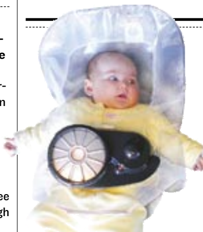
The BabyScape hood fits kids 3 years and under. ($170, 800-957-8955)