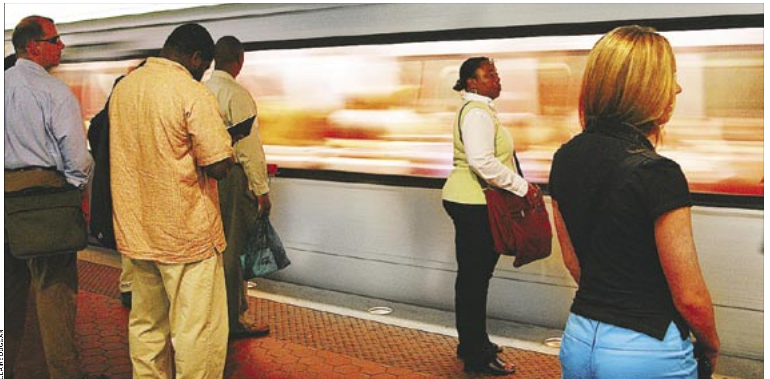
IN MOTION: Commuters wait for a train on June 15. Metrorail set a record on June 9, the first day of Ronald Reagan's state funeral ceremony, with 850,636 trips taken.