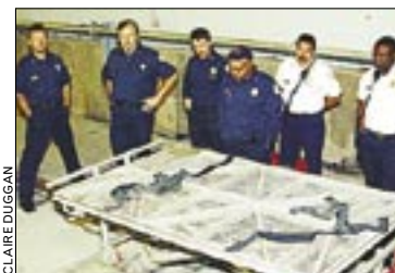
Alexandria firefighters observe an evacuation cart at Metro's training facility.

Wheelchairs and strollers are probably too big for the tunnel's walkway, so they may need to be left behind. If that's the case, Metro will try to recover them when the emergency is over. For those who can't walk, means of evacuation could include being carried or placed on one of the evacuation carts that are stored throughout the tunnels. The carts roll on the two running rails and can transport four people at a time or up to 1,000 pounds. Fire departments also have equipment such as plastic sleds that can be used to carry passengers.