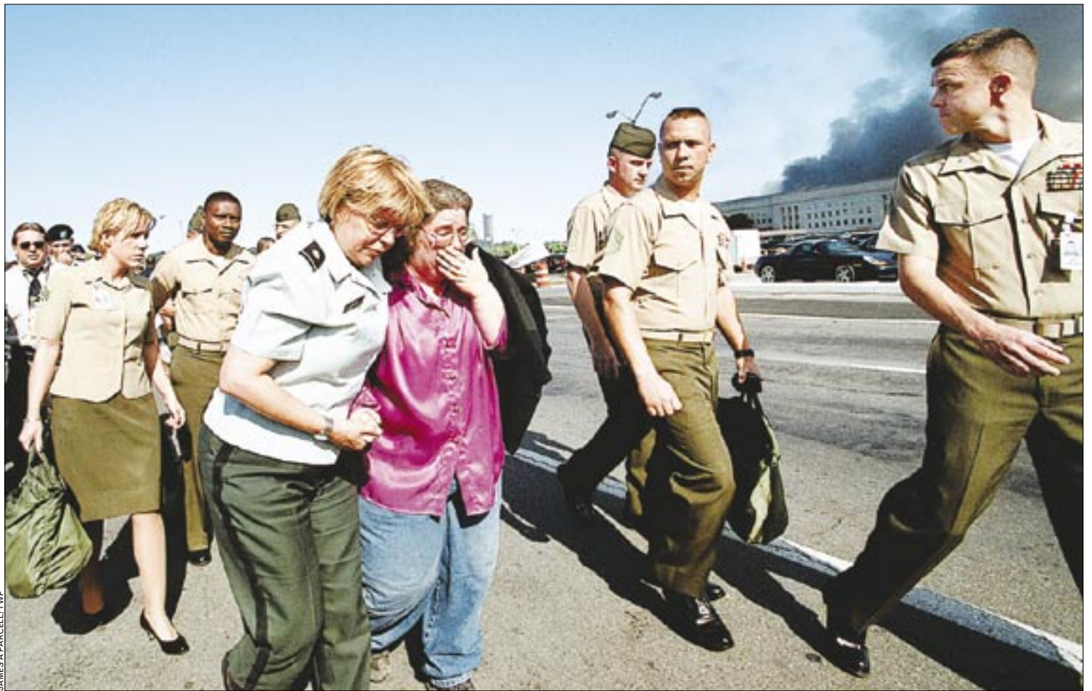
WALKING AWAY: Rather than panic, Pentagon employees evacuated in an orderly fashion after a plane crashed into the building's outer ring on Sept. 11, 2001.

Prepare: Facts on chemical, biological, radiological weapons | washingtonpost.com/preparedness