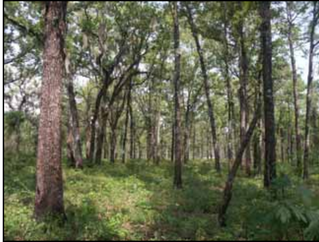
Fig. 3. Habitat of var. gentianoides . Apalachee WMA, Jackson Co., FL. Photo by V. Negrón-Ortiz, 2007.

Var. gentianoides can be found growing as a solitary individual or in small clumps in predominately well drained upland pinelands where it is a component of a fire-prone longleaf pine-wiregrass ecosystem, in areas where limestone outcrops and calcareous soils are widespread, and in soils somewhat dry but rich in humus. It is also found in pine-oak-hickory woods at Apalachee WMA (Jenkins and Diamond 2007), which consists of two soil types, Blanton coarse sand