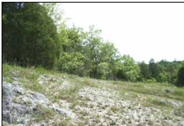
Fig. 4. Ketona Dolomite glade, habitat of var. alabamensis , Bibb County Glades Preserve, Alabama.

Var. alabamensis is found in glades (open, almost treeless areas within woodland) that have developed over an ancient rock formation known as Ketona Dolomite ( mindspring.com/~jallison/lostworld.htm ).