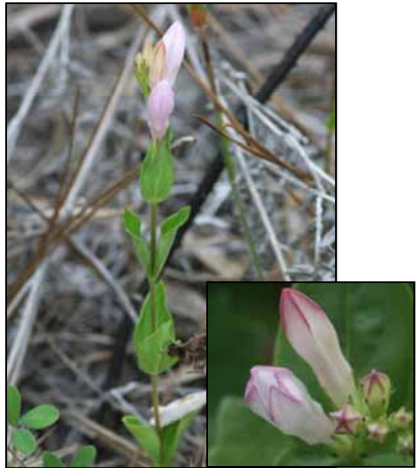
S. gentianoides var. gentianoides

U.S. Fish and Wildlife Service Southeast Region Panama City Field Office Panama City, Florida