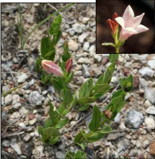
S. gentianoides var. alabamensis