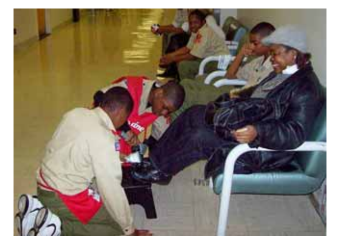
Members of Boy Scout Troop #117 and Cub Scout Troop #3117 provided complimentary shoe shines to veterans at JBVAMC prior to its Veterans Day ceremony on November 11.