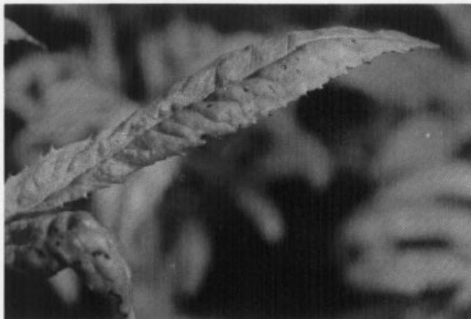
Fig. 3. Manganese toxicity induced in 'First Lady' marigold with 0.36 mM (20 ppm) MnCl_2 .

affect on media pH (likely due to buffering capacity of peat, residual CaCO_3 , and high NH_4-N ) or the occurrence of symptoms.