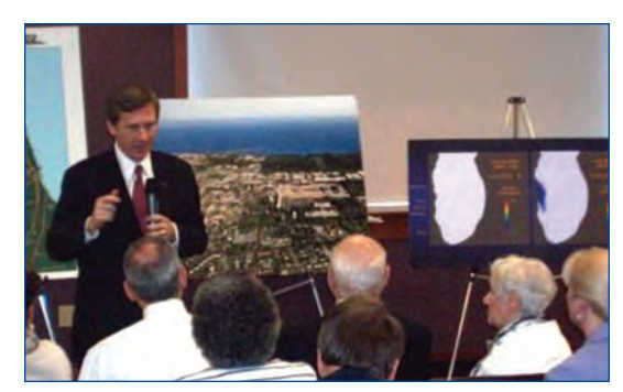
Congressman Kirk answers questions about measures needed to ban sewage dumping in Lake Michigan.

Nearly 100 people from northwest Cook County joined Congressman Kirk for a town hall meeting at the Mount Prospect Public Library. For more