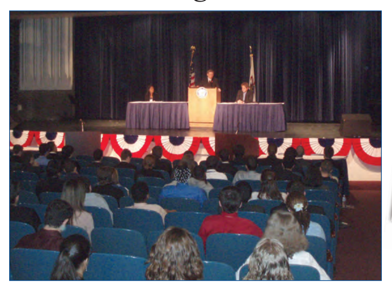
Congressman Kirk welcomes high school students participating in the First Annual 10th Congressional District Model Congress.

For a weekend in April, nearly 100 high school students converged on Stevenson High School in Lincolnshire to participate in the First Annual 10th Congressional District Model Congress. Students took on the roles of actual representatives and participated in congressional hearings, "mark up" legislative sessions and floor debate. With Earth Day on Sunday, students also considered environmentallythemed legislation. H.R. 1 established U.S. policy toward climate change, and H.R. 2 authorized the creation of the 10th Congressional District Student Conservation Corps. Both bills passed during the Model Congress session.