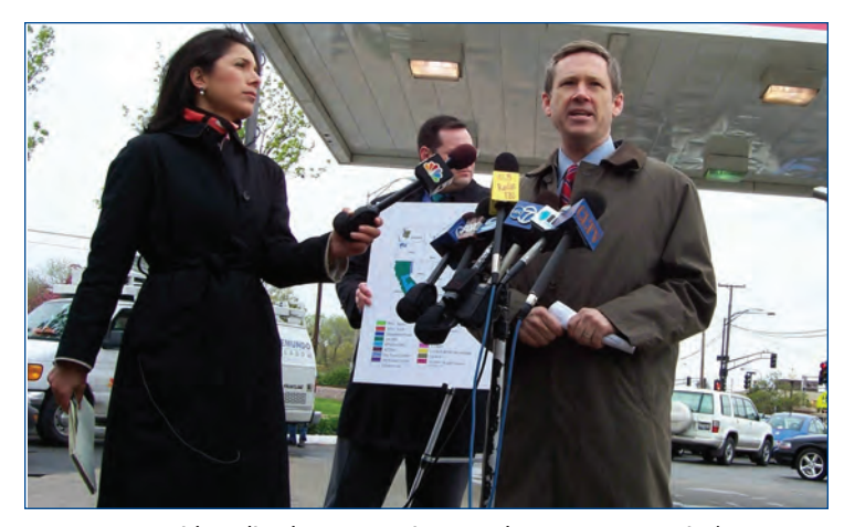
Congressman Kirk outlined an aggressive agenda to restore America's energy independence. The 2005 Energy Policy Act made a number of key reforms, but more action is required.