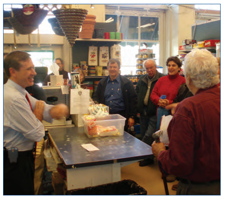
Congressman Kirk hosted a Town Hall meeting and answered questions at the Linden True Value in Wilmette.