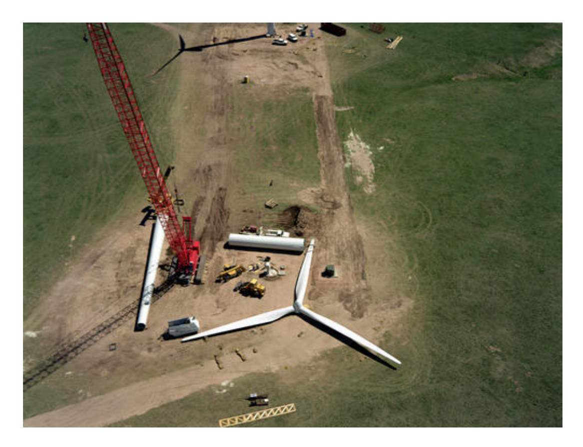
FIGURE 3.1.2-1 Arial View of Preparations to Erect a Wind Turbine Tower at the Public Service of Colorado Ponnequin Wind Farm, Weld County, Colorado (Source: NREL 2004a, Photo #08607. Photo credit: Warren Getz.)