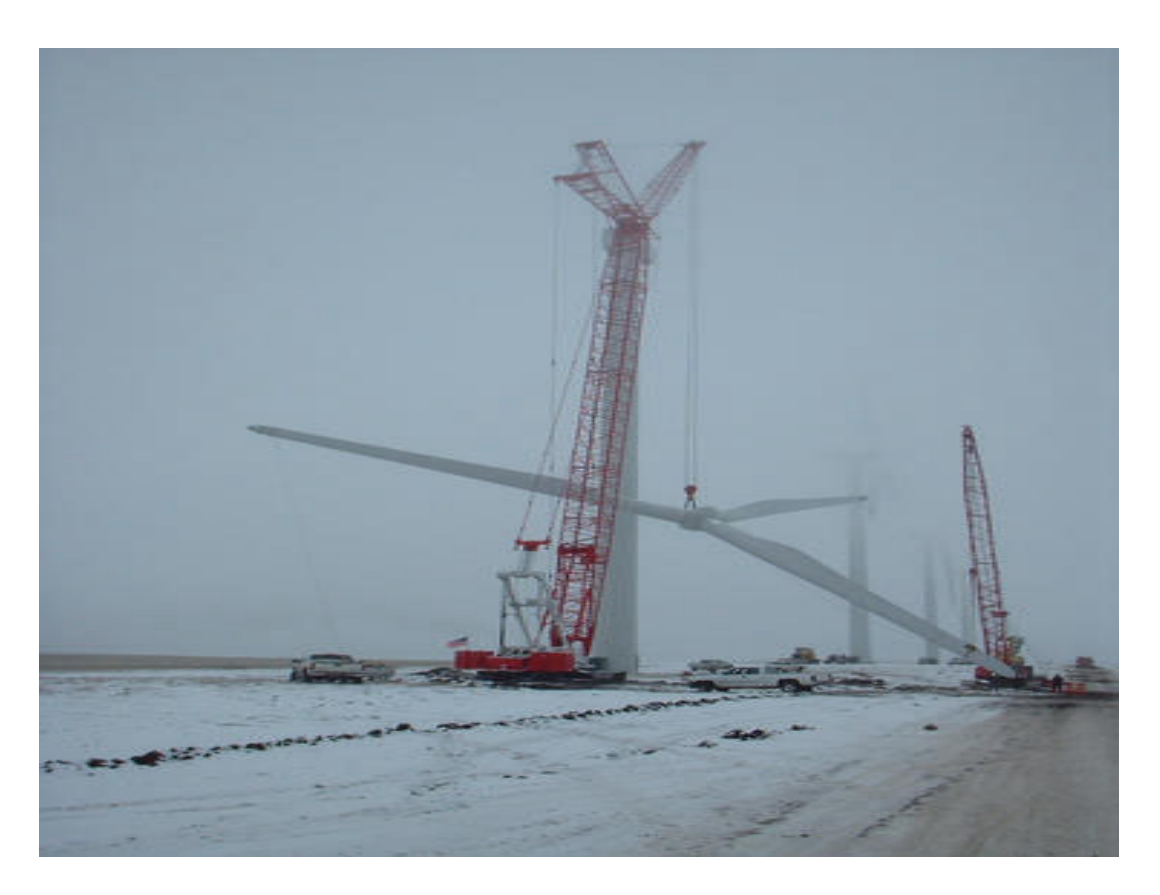
FIGURE 3.1.2-3 Installation of a Rotor on a General Electric 1.5-MW Wind Turbine at the Klondike, Oregon, Wind Farm

transformers would be sealed. For the largest models, installation may involve adding dielectric fluids after they are positioned on their foundations. Transformer bushings, switches, capacitors, and other dielectric fluid-containing electrical devices are likely to use mineral-oil-based dielectric oils with no polychlorinated biphenyls (PCBs).