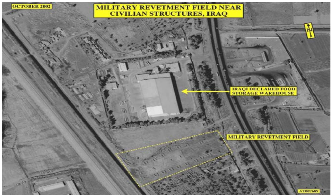
Figure 7—Iraqi Military Revetments Near Civilian Village and School