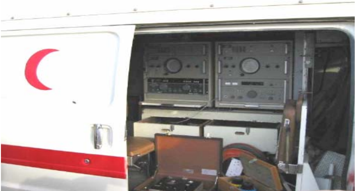
Figure 3—Iraqi Civilian Ambulance Used for Military Communications