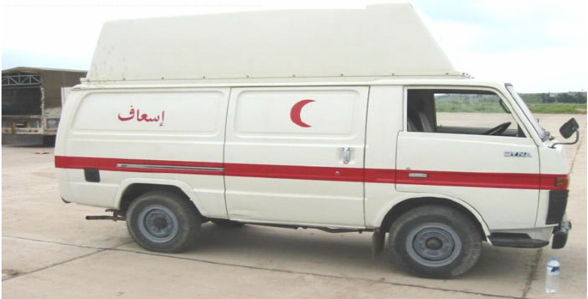
CAPABLE OF INTERCEPTING AND DIRECTION-FINDING HF, VHF AND UHF SINGLE-CHANNEL UNENCRYPTED SIGNALS