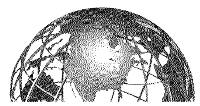
FULTON INTERNATIONAL GROUP