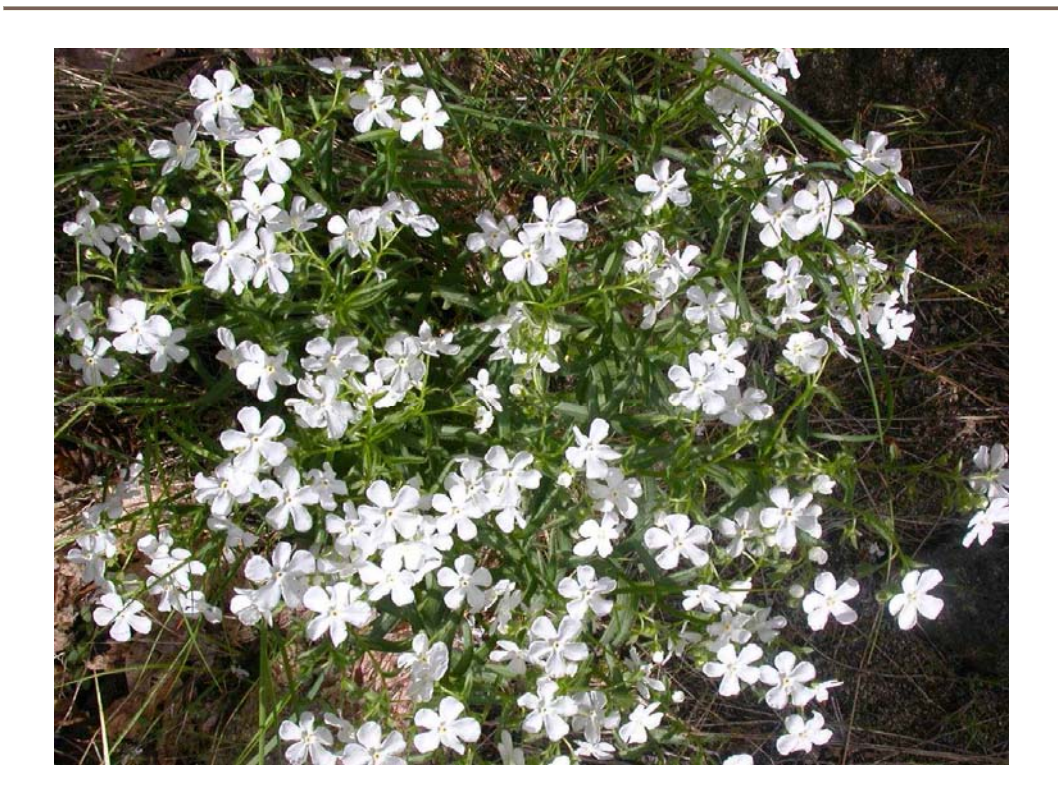
Figure 2. Hackelia venusta in flower.

per flower, approximately 0.38 to 0.43 centimeters (0.15 to 0.17 inches) long. The marginal prickles are united for up to one-half of their length, forming a flange around the nutlet (Gentry and Carr 1976).