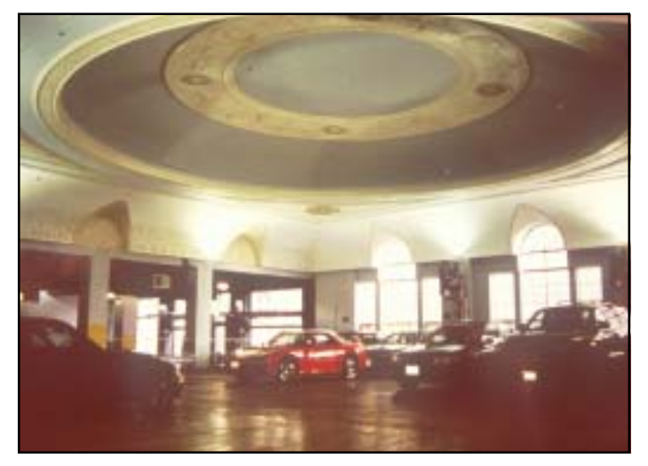
Parking cars in this highly-finished space is not a compatible treatment.

Application 3 ( Incompatible treatment ): Parking cars is never appropriate in historically finished interiors, as demonstrated by the following example: