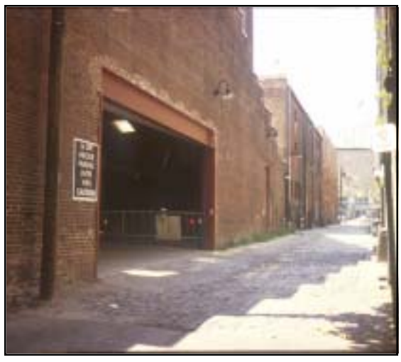
The new parking entrance is appropriately located along an alley where two smaller openings were enlarged to accommodate vehicular traffic.

When this late-nineteenth/early-twentieth century brick warehouse complex was converted to office and retail use, the local jurisdiction required the owner to provide a large amount of parking. Although the space designated for parking was not originally intended for this purpose, its utilitarian character lent itself well for this function and its warehouse quality, complete with its heavy-timber trusses, was left exposed. The entrance to the parking area was located along an alley, where existing openings were combined for vehicular use.