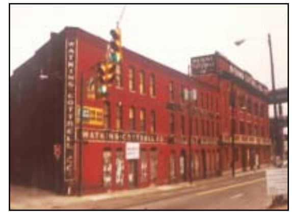
This brick warehouse complex built between 1865 and 1905 was converted to commerical and retail uses. A concealed rear structure worked well for interior parking.

Parking inside historic buildings must not require extensive new openings on significant facades, and must provide adequate ventilation without disturbing the appearance of the existing fenestration. Mechanical ventilation is generally preferable to removing louvers or windows. The parked cars must also be screened from public view.