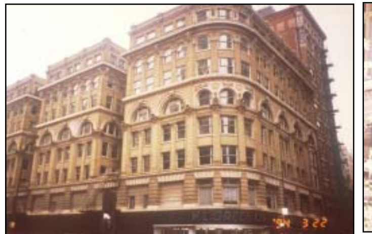
The parking area in this early-twentieth century structure is not visible to the public.

late to the roof, so other alternatives were investigated. The solution was to direct the exhaust out through and above the retail space. A modest transom detail was developed as part of the new compatible replacement storefront, which alternated spandrel glass with a dark screening material. This screening provided the necessary ventilation, without being too visually intrusive.