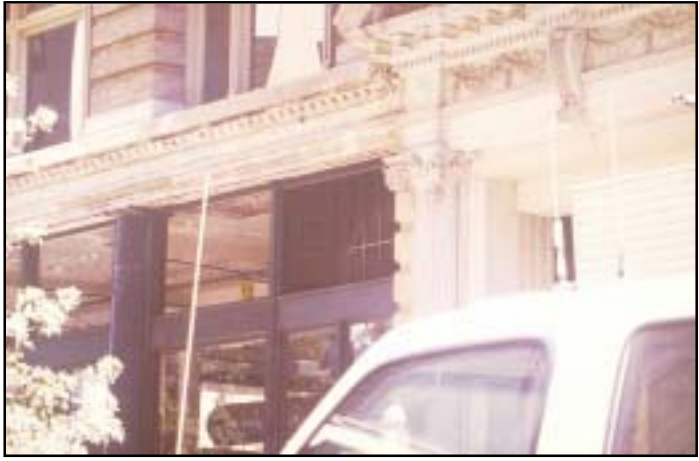
Detail of transom (under construction).

Application 3 ( Incompatible treatment ): Parking cars is never appropriate in historically finished interiors, as demonstrated by the following example: