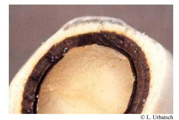
Cross-section of seed showing tallow portion.

To determine its potential to invade and persist in hardwood forests, the shade tolerance of Chinese tallow was compared to American sycamore ( Platanus occidentalis ) and cherrybark oak ( Quercus pagoda ) in a series of experiments (Jones & McLeod 1989). Tallow tree growth was shown to exceed sycamore and oak in shade, and tallow tree and sycamore growth exceeded oak in full sun. Such findings are consistent with observed patterns of tallow tree growth in North America. With its ability to grow rapidly in sunlight or under closed canopies, the species is likely to invade and persist in many of the floodplain forests of the coastal Southeast.