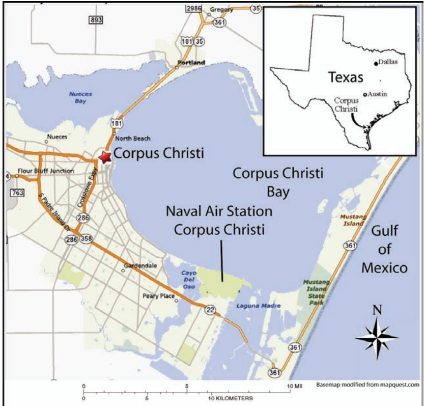
Figure 1. Location of Naval Air Station Corpus Christi, Corpus Christi, Texas.

Chlorobenzene, which has no known natural sources, can be released to the environment as a pesticide carrier (Meek and others, 1994a), in the manufacture of rubber polymers, as a carrier for textile dyes, in the production of phenol and nitrochlorobenzene, in the formulation of herbicides, and as a solvent in the manufacture of adhesives, paints, resins, dyes, and drugs (Grosjean, 1991; Mackay and others, 1996; World Health Organization, 2004).