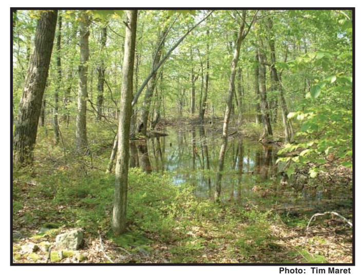
Plate 1-1. Mid-Atlantic seasonal pool. This seasonal forest pool is located in south-central Pennsylvania.

Seasonal pools are dynamic habitats that have cycles of standing water (Plate 1-1). These unique pools fill with rainwater, surface runoff, snowmelt, or groundwater in the fall, winter, or spring and may completely dry out by the summer. Seasonal pools are referred to by a variety of names, including vernal pools, spring pools, ephemeral wetlands, autumnal pools, woodland ponds, and temporary ponds. Seasonal pools provide important ecological services to the mid-Atlantic region (Box 1-1).