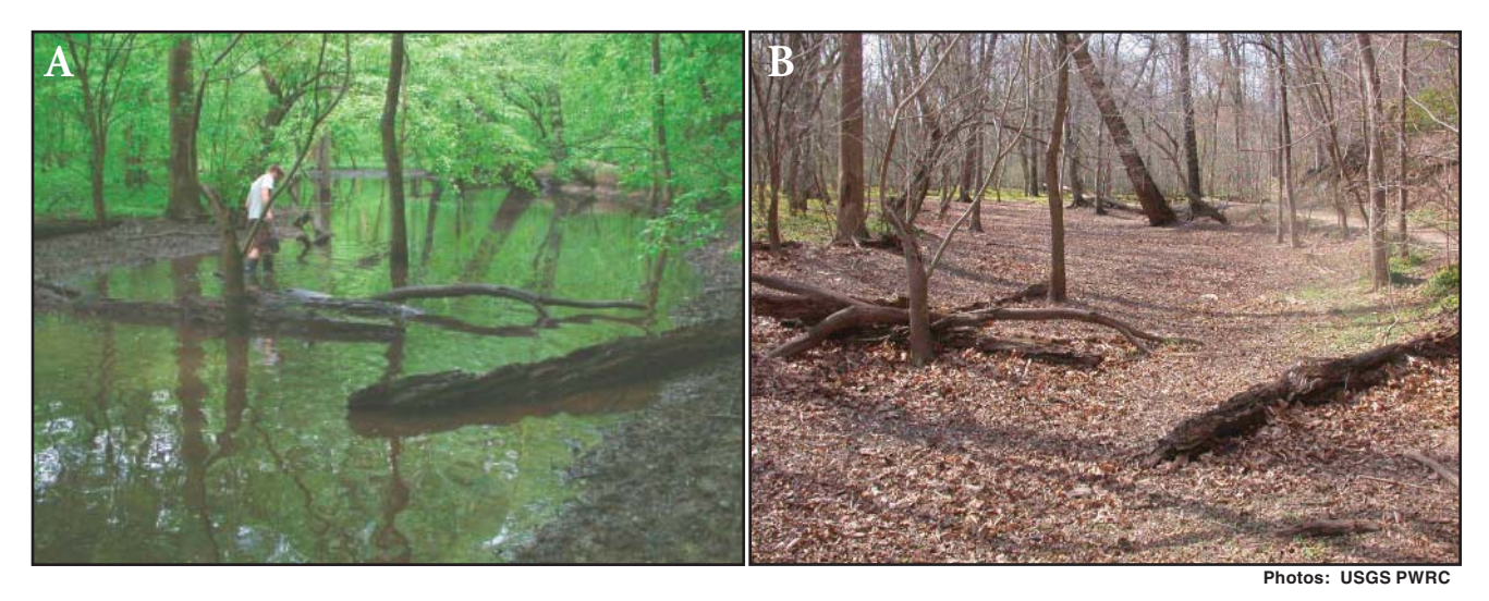
Plate 1-3. A seasonal pool's wet stage and dry stage. A seasonal pool in Rock Creek Park, D.C., is shown (A) in spring when the pool is full of water and (B) in fall when the pool has dried.

Seasonal pools display considerable variation in hydroperiods (length of time that a pool is filled with water) and water levels (depth at which the pool is filled) across the landscape (Williams, 1987; Semlitsch, 2000). The hydroperiod is the most powerful abiotic factor determining the composition of a seasonal pool community (Wiggins et al., 1980; Skelly, 1997; Morey, 1998). The differences between pools are due to regional climatic patterns