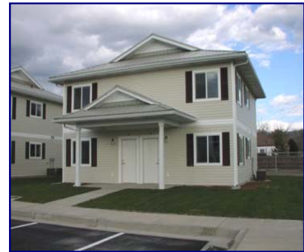
One of 12 Farm Labor Housing units in Beaver.

Multi Family Housing Program (MFH) Loans – Rural Development finances leveraged MFH loans to eligible affordable housing developers/sponsors at a rate and term of 1% for 50 years for the construction of very low- and low-income rental units in rural Utah. During FY 2002 the MFH program funded two portfolio rehabilitations, one new construction complex and a Housing Preservation Grant in the amount of $2,059,028. This consists of improving and/or adding 73 units to our portfolio.