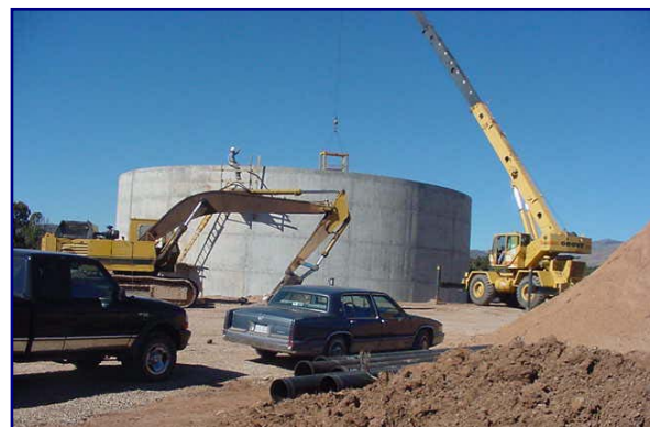
Manila Water Project.

Local initiative, leadership and community support are the critical factors in making a project a reality. USDA Rural Development in Utah has a knowledgeable staff available to assist with applications and provide technical assistance, to consider different project options, and to look at feasibility and to discuss financing opportunities with people and communities in rural Utah.