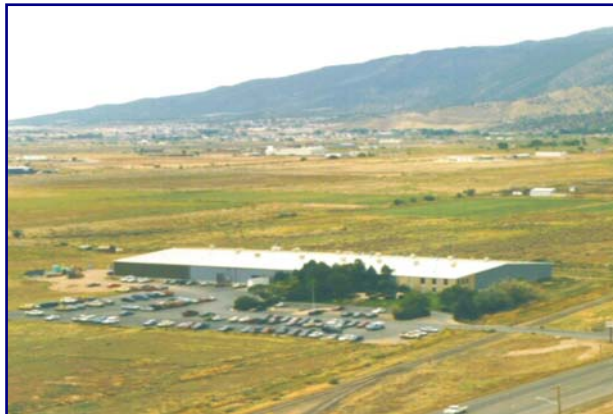
Metalcraft factory and offices located in Cedar City. RBS B&I guaranteed loan recipient.

are submitted to RBS by a commercial lender for a Federal guarantee on the lender's loan. RBS can guarantee up to 80% of a loan made by a bank or other approved lender.