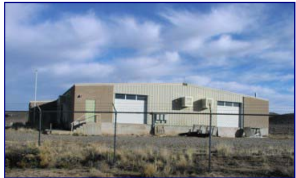
A Navajo sewing cooperative in Montezuma Creek received RBS grant funds to assist in a feasibility study to re-open the closed plant.

Business & Industry (B&I) Guaranteed Loan Program - Rural lenders utilize the effective Guaranteed Business and Industry loan program to guarantee loans to good quality businesses that support a diversified economic base and provide or save good quality jobs in rural areas. The Guaranteed B&I loan program allows lenders to make more larger-sized loans to sound rural businesses with longer loan terms and lower interest rates than would otherwise be available. Guaranteed Business and Industry loan requests