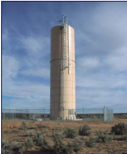
A new water tank for the White Mesa Utes was funded by an RD Set-aside Grant.

households and businesses that previously had inadequate individual systems. The solid waste disposal project provides garbage collection services for the first time to 742 homes and businesses located on the Uintah and Ouray Ute Reservation in northeastern Utah.