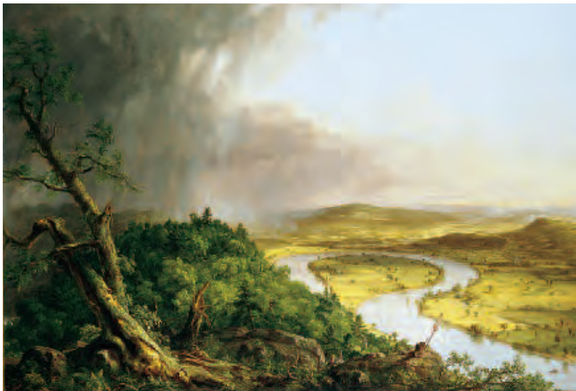
5-A Thomas Cole (1801–1848), View from Mount Holyoke, Northampton, Massachusetts, after a Thunderstorm — The Oxbow, 1836. Oil on canvas, 51½ x 76 in. (130.8 x 193 cm.). The Metropolitan Museum of Art, Gift of Mrs. Russell Sage, 1908 (08.228).

Landscape was a popular and profitable type of painting in the early decades of the nineteenth century, when a growing population of urban dwellers looked on rural life as a remedy for the problems of industrialization. If they were too caught up in business to make weekend trips to the country, these affluent people could at least turn their gaze on a peaceful picture of the life they'd left behind. Cole's decision to portray the famous view from Mount Holyoke was initially commercial: he took advantage of the American taste for identifiable native scenery to paint what he hoped would be a marketable painting.