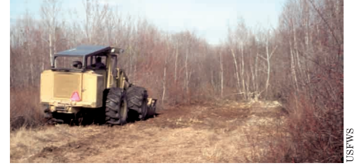
Maintaining open field habitat

Refuge biologists are conducting a number of population surveys and inventories focusing on American woodcock, marsh birds, breeding birds, frogs and toads. Research partners provide refuge managers with additional data. All of this information will help to determine future wildlife and habitat management efforts.