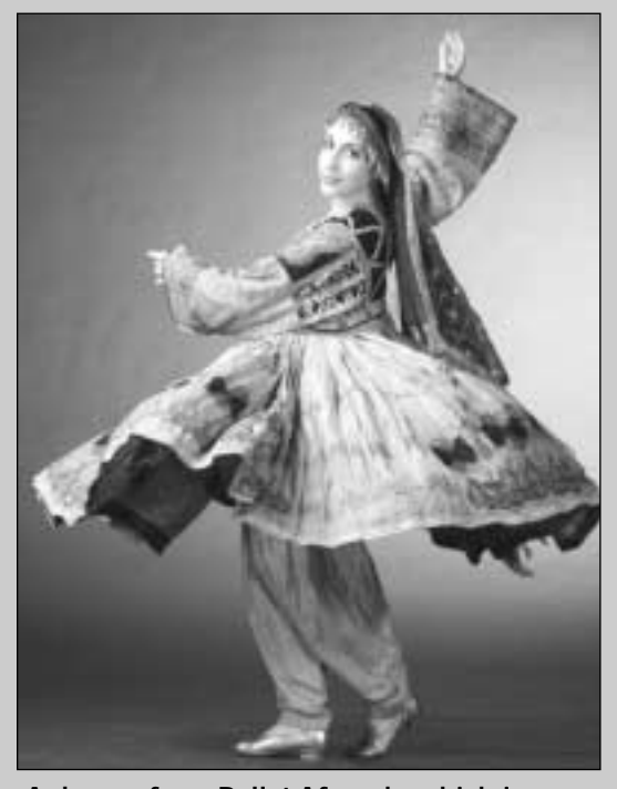
A dancer from Ballet Afsaneh, which is one of the featured groups at Diversity Day.

Ethnic food, offered for sale by several of the Lab's networking groups, will include a Filipino lunch, Afghan lunch, taquitos and