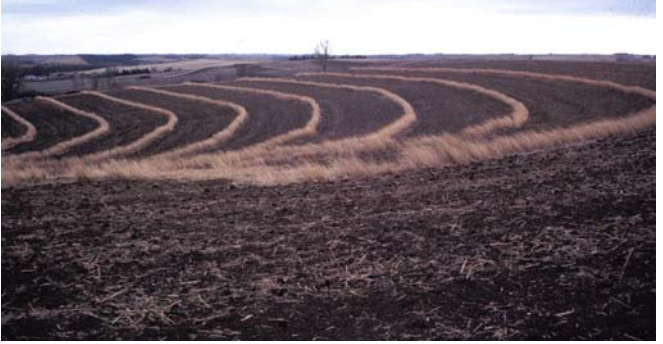
Switchgrass hedge width and interval.

Figure 1. Topography of 6-ha watershed showing