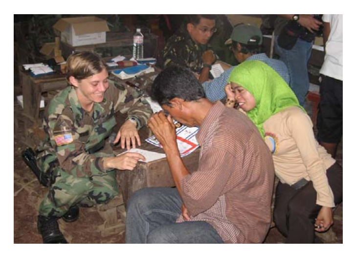
An American service member helps a local resident test new reading glasses provided during a free Medical Civic Action Project (MEDCAP) on Jolo in 2006 organized by JSOTF-P.

Eliminating the recruiting ground and sanctuary for terrorists goes hand in hand with development work and diplomacy.