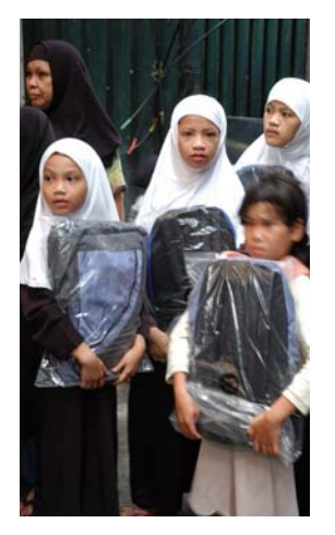
Muslim students in Zamboanga City hold backpacks donated by the U.S. Government.

improving the quality of instruction — particularly in math, science, and English — and providing vocational training opportunities and courses to prepare out-of-school youth for re-entry into the formal education system.