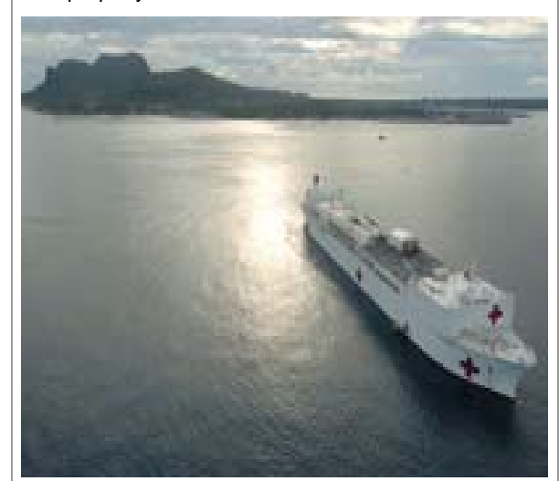
The USNS hospital ship Mercy anchored off Tawi-Tawi Island in June 2006.

In just one example of the public diplomacy successes of the USNS Mercy deployment, the USNS Mercy staff treated a victim of the March 2006 terrorist bombing of the grocery store in Jolo City that killed nine civilians and injured 25. USNS Mercy medical staff treated the victim's second-degree burns and provided advice on physical therapy needed to help his damaged arm heal properly.