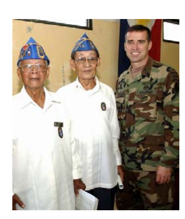
An American service member meets Filipino veterans on Jolo at a ceremony to honor their service during World War II.

The U.S.-Philippines relationship is strengthened by the millions of overseas Filipinos and their children who today call the U.S. their home. In addition, the United States continues to recognize the valor of Filipino war veterans who fought side-by-side with their American counterparts during the Second World War. Many Filipino veterans living in the Philippines and the United States enjoy U.S. Department of Veterans Affairs and Social Security Administration benefits as a result of their military service.