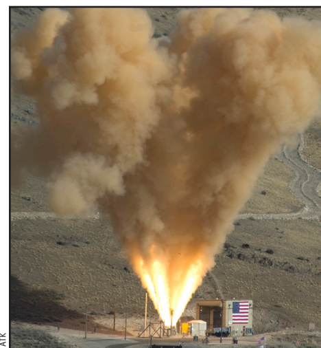
Launch abort system motor test firing