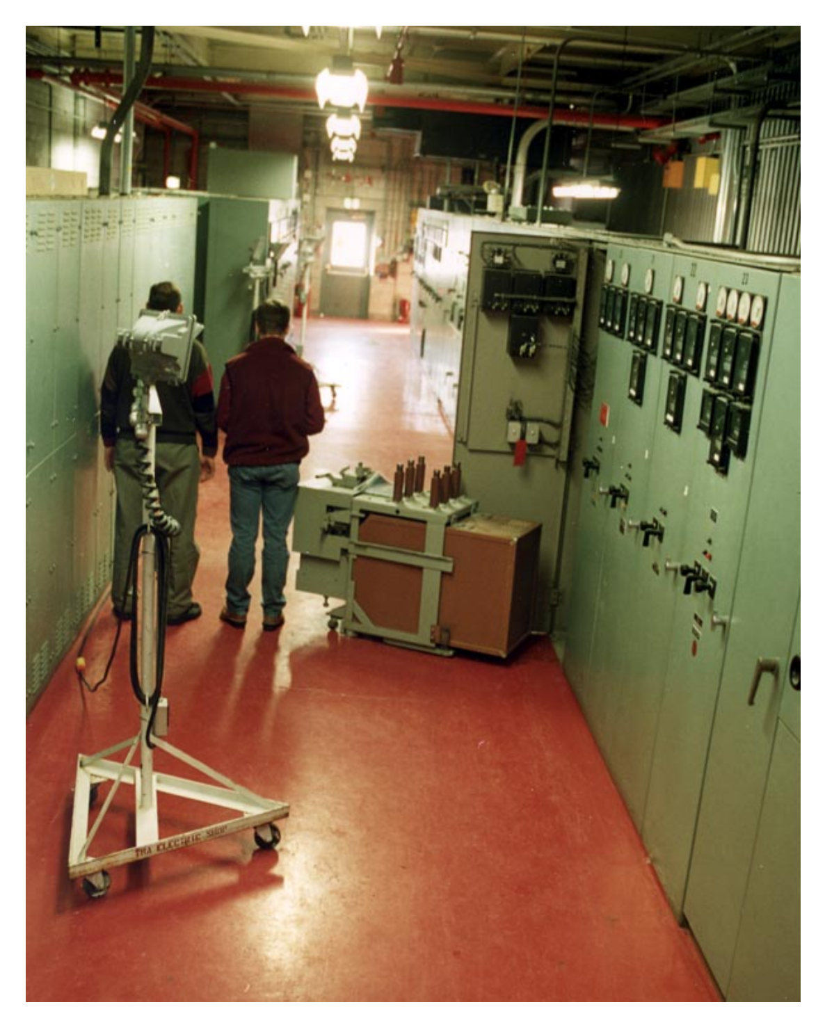
Figure 2-1. Clear egress path around electrical work equipment.