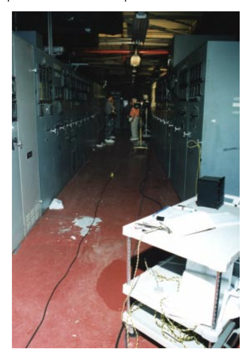
Figure 2-2. Clear egress path to west door remains even after equipment was moved during the rescue.

Looking at Exhibit 2-5 in the Investigation Report, a reader might infer that the egress path to the west door was blocked. Such an inference would be incorrect for two reasons. First, the equipment carts, papers, and cables shown in the Investigation Report Exhibit were dragged to the area south of the west door when the fire engineer and a security guard rescued a worker.<sup>27</sup> This equipment was positioned out of the egress pathway when the work was being performed. Second, even after the equipment had been dragged to the area south of the west door, the main aisle still provided a clear egress path. Figure 2-2, taken at about the same time as Exhibit 2-5 in the Investigation Report, looking in from the west door, shows the clear egress path down the main aisle. As is evident from Figure 2-2, the egress path to the west door met the requirements of 29 CFR 1910 Subpart E.