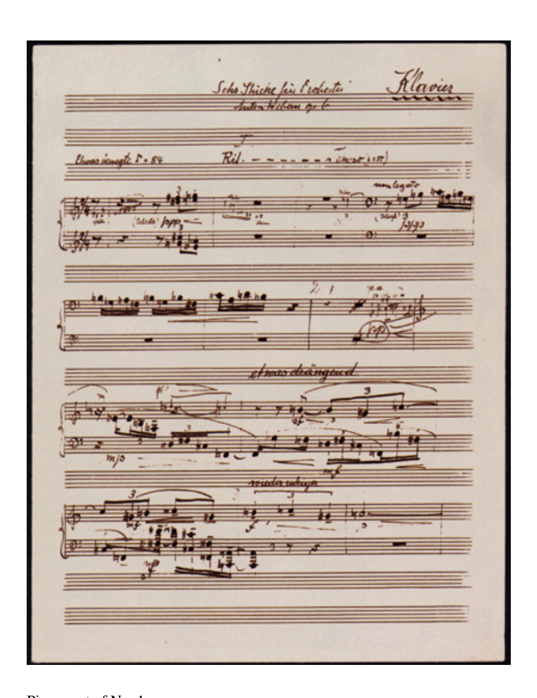
Piano part of No. 1

Even though a more detailed comparison shows that Webern subtly varied these techniques of reinstrumentation according to the musical context, <sup>18</sup> the impression may still arise that the chamber version of op. 6 represents merely a necessary expedient rather than a fully valid alternate version. However, we should bear in mind that Webern was responding just as much to some general aesthetic tendencies of the time as to the limited performing conditions of the Verein . In particular, his arrangement of op. 6 is indebted to the principle of "soloistic instrumentation,"