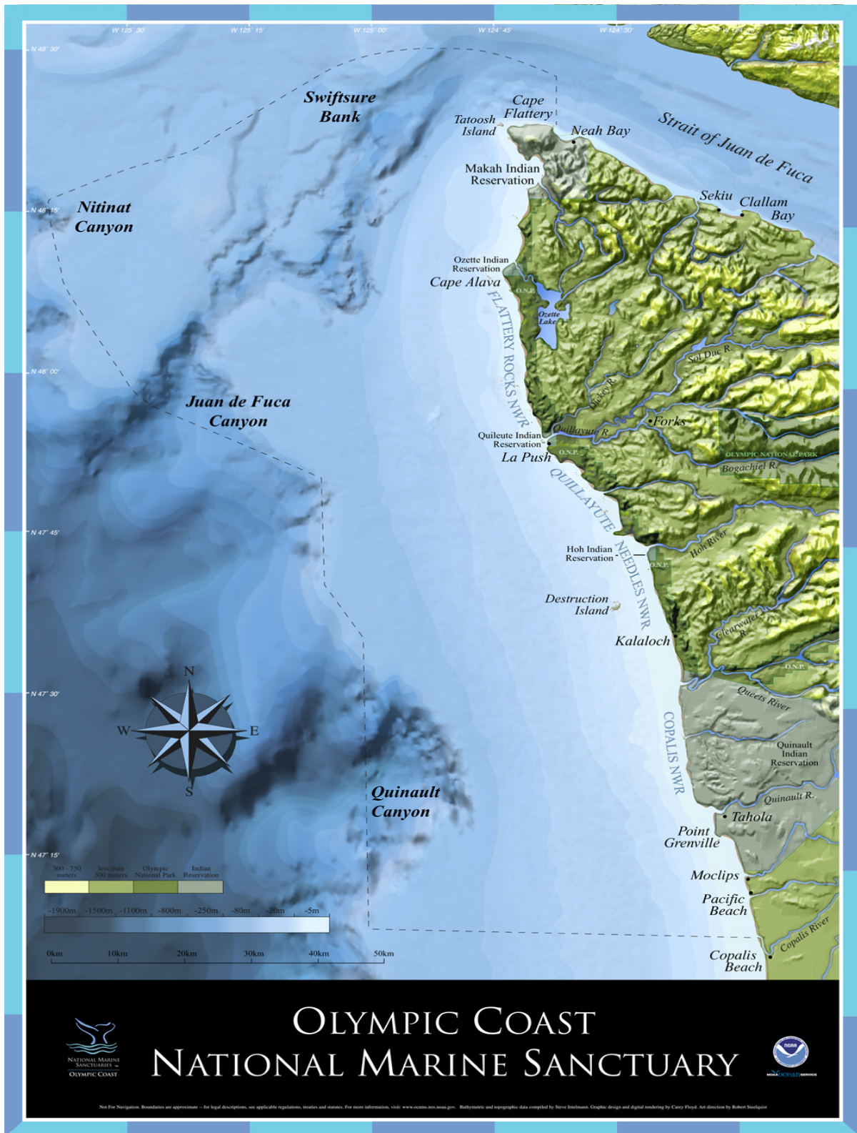
Figure 1. Map of Olympic Coast National Marine Sanctuary.