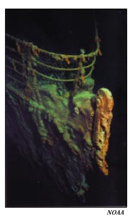
An external camera mounted on Mir I captures a view of Titanic's bow sitting serenely on the sea floor.