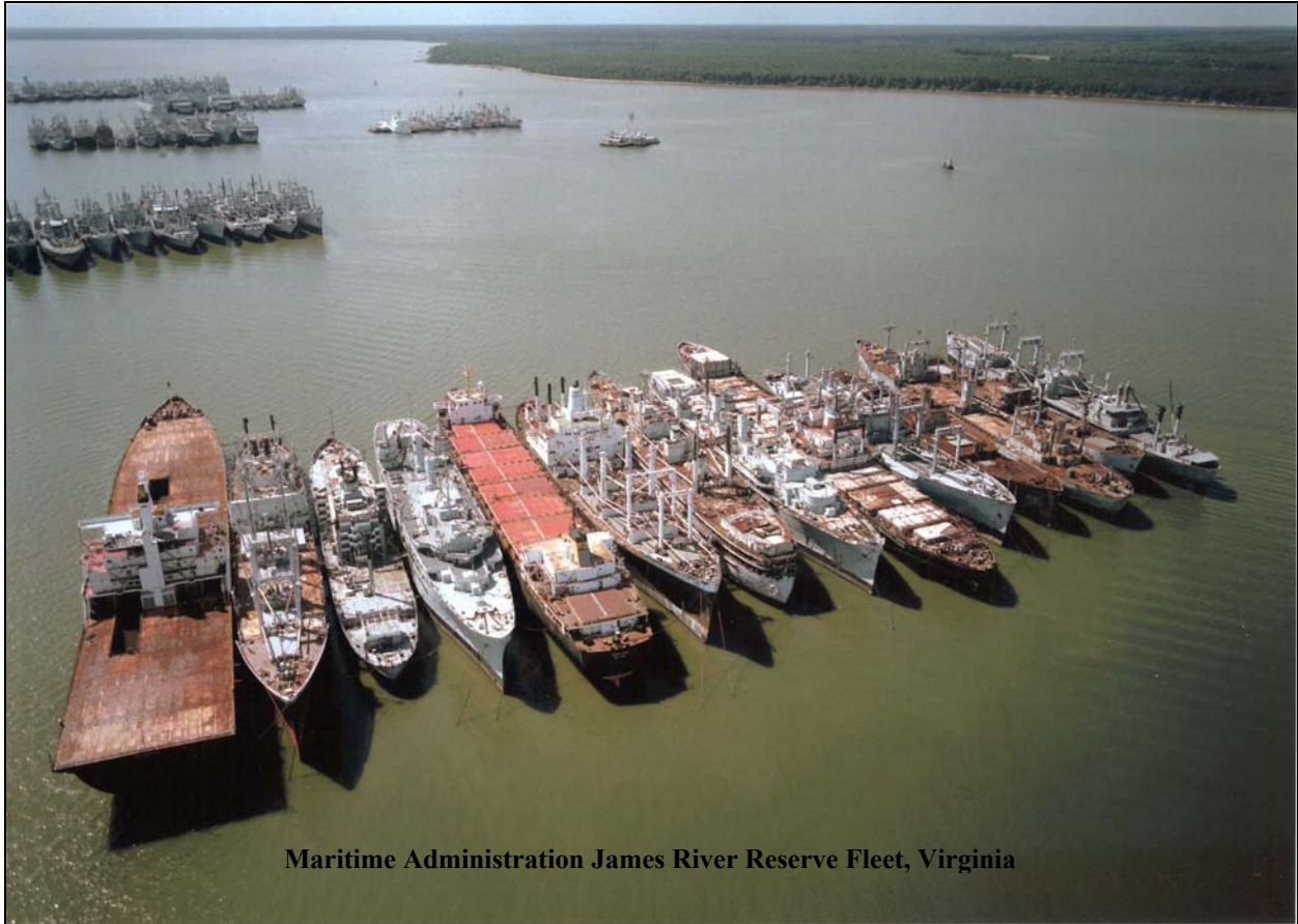
Maritime Administration James River Reserve Fleet, Virginia