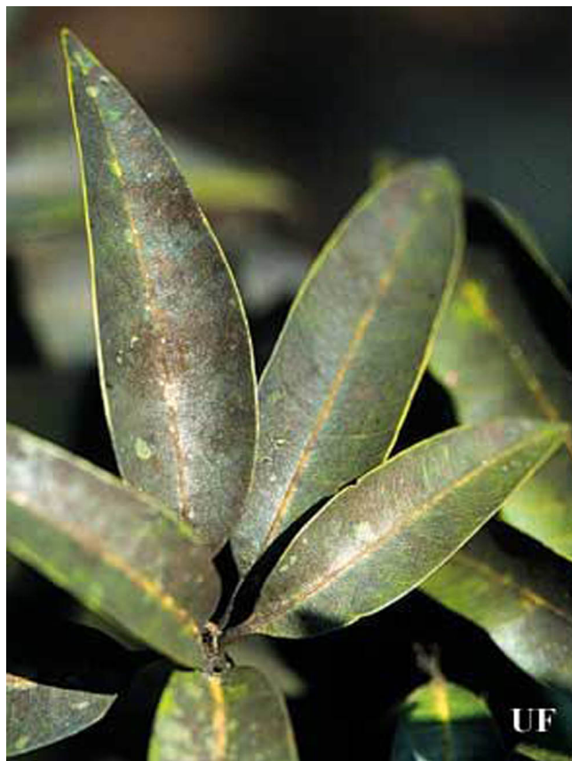
Figure 4. Sooty mold on mango leaves, an indirect result of infestation by lobate lac scale, Paratachardina lobata lobata (Chamberlin). Credits: F. W. Howard, University of Florida

On highly susceptible hosts, the scale insects are crowded, forming a contiguous mass that appears as a dark, lumpy crust. On wax-myrtle ( Myrica cerifera ), a highly susceptible host, up to 42 mature females have been counted per 1 cm segment of twig. Sooty mold covers the branches, the insects themselves, and occurs in patches on the foliage. Dense infestations are associated with branch dieback of some plant species, and in severe cases, highly infested shrubs and small trees have died. Wax-myrtle is especially prone to become heavily infested and die from the effects of lobate lac scale. Some plant species appear to tolerate dense infestations, but this may be illusory, as the long-term effects of such infestations are not yet known.