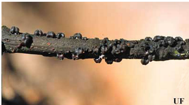
Figure 6. Twig of mango infested with lobate lac scale, Paratachardina lobata lobata (Chamberlin).

species native to Florida. Most of the exotic host plants are grown as ornamental shrubs or trees, or as fruit trees. Some of these are extremely important in the urban landscape as shade trees, specimen trees, or hedges. Some plant families, notably Fabaceae, Myrtaceae, and Moraceae are especially well represented by species that serve as hosts, but this may be related to their abundance in the landscape or other biases. Plants at different sites have been exposed to infestations for different periods and infestation levels are highly variable. Differences in susceptibility have not been determined experimentally. However, certain species appear to be highly susceptible, including certain natives, e.g., wax-myrtle, cocoplum ( Chrysobalanus icaco ), buttonwood ( Conocarpus erectus ), strangler-fig ( Ficus aurea ), myrsine ( Myrsine guianensis ), red bay ( Persea borbonia ), and wild-coffee ( Psychotria nervosa ); popular exotic ornamental plants, e.g., black-olive ( Bucida buceras ), Indian laurel ( Ficus microcarpa ), Benjamin fig ( F. benjamina ); and fruit trees, e.g., lychee ( Litchi chinensis ), mango ( Mangifera indica ), and star-fruit ( Averrhoa carambola ).