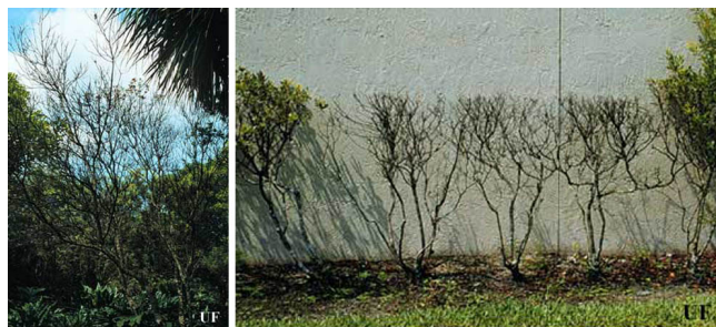
Figure 5. Wax-myrtles in the wild (left) and as a hedge (right) killed by infestations of lobate lac scale, Paratachardina lobata lobata (Chamberlin).