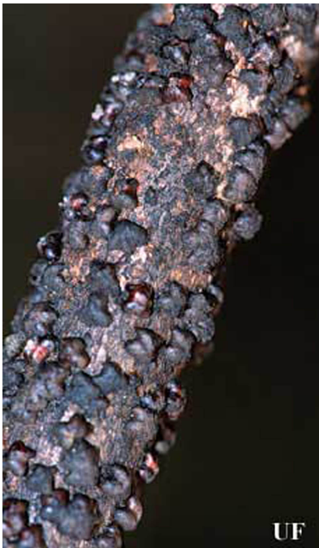
Figure 3. Wax-myrtle branch infested with lobate lac scale, Paratachardina lobata lobata (Chamberlin).

On highly susceptible hosts, the scale insects are crowded, forming a contiguous mass that appears as a dark, lumpy crust. On wax-myrtle ( Myrica cerifera ), a highly susceptible host, up to 42 mature females have been counted per 1 cm segment of twig. Sooty mold covers the branches, the insects themselves, and occurs in patches on the foliage. Dense infestations are associated with branch dieback of some plant species, and in severe cases, highly infested shrubs and small trees have died. Wax-myrtle is especially prone to become heavily infested and die from the effects of lobate lac scale. Some plant species appear to tolerate dense infestations, but this may be illusory, as the long-term effects of such infestations are not yet known.