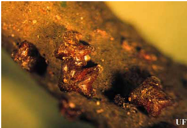
Figure 1. Mature females of lobate lac scale, Paratachardina lobata lobata (Chamberlin).

eye, this scale insect's x-shaped appearance is discernable, even without magnification. The testa is extremely hard and brittle, glossy and of a dark reddish brown color, but often appears dull and black due to a coating of sooty-mold. The first instars (crawlers) are elongate-oval, deep red, and about 0.2 mm long. The characteristic lobate pattern develops in the second instar. The second instar female presumably molts to the adult female as in other scale insects. Males of this species have not been observed in Florida.