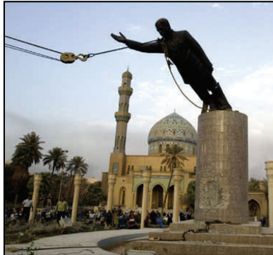
Iraqis, with the help of American soldiers, topple a statue of Saddam Hussein, March 2003.

The defeat of Iraq's military was swift and reminiscent of the first Gulf War. In early 2003, coalition forces rolled into Baghdad amid celebrations by the Iraqi people. Hussein had ruled with an iron fist, committed atrocities against the Iraqi people, and attempted genocide against the Kurds. His departure from power was celebrated by the vast majority of Iraqis. These celebrations, however, were short-lived. The reality of