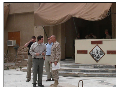
Congressman Nunes in Fallujah, April 29, 2007.

However, there I was in Fallujah. I was walking around with military officials in the open. This region had been a hotbed of terrorist activity and was described as "lost" in intelligence and Defense Department reporting not more than a year ago.