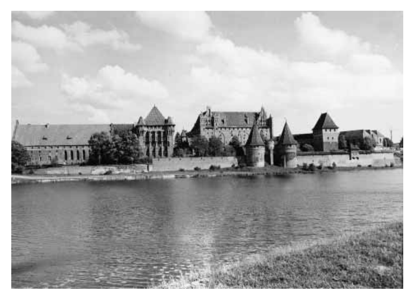
2 The Teutonic Knights' castle and principal administrative seat, at Malbork (Marienburg). Fourteenth century. The castle underwent extensive restoration in the 1820s by the Prussian authorities, who used it as a showcase for the Teutonic Knights' (and, by extension, Prussia's) 'historic mission' in the east.

leaving five young sons, all more German than Polish. The region's knights preferred Łokietek to fragmentation and German rule, but it was not until the submission of the town of Poznań in November 1314 that serious opposition was eliminated. In control of Wielkopolska and Kraków, Łokietek could realistically aspire to the royal dignity - were it not for the rival claims of the new king of Bohemia, John of Luxemburg, who had cheerfully taken over the claims of his Přemyslid predecessors. Most of the Silesian and Masovian dukes looked to him. Brandenburg and the Teutonic Knights endorsed him, in the expectation of satisfying their own titles and claims. Pope John XXII, whose consent was necessary to a coronation in what was technically a papal fief, was reluctant to offend either party. He gave his consent in terms so ambiguous as to suggest that he considered both men to have a legitimate royal title. When Łokietek's coronation did finally take place on 20 January 1320, it was not in Gniezno but, for the first time, in