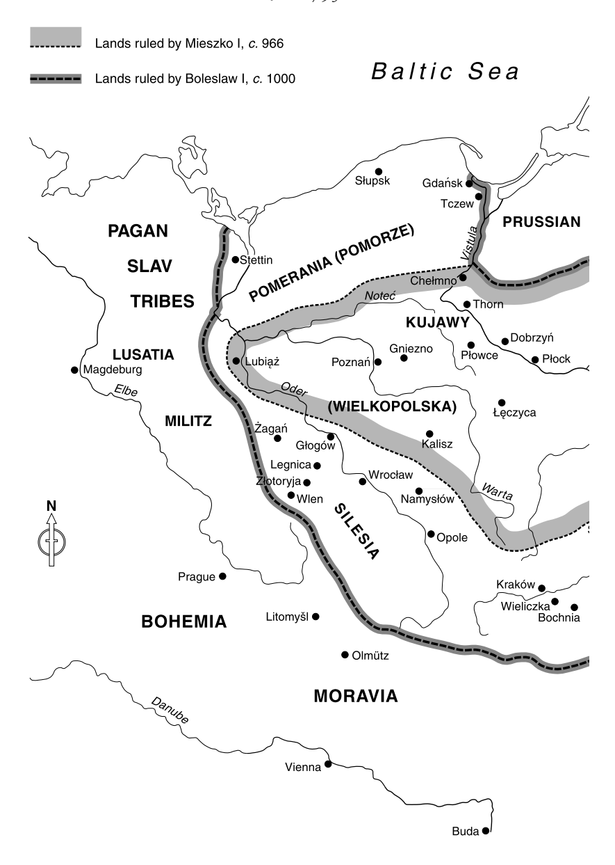
Map I Early Piast Poland, c. 1000.