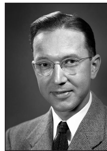
A young William Higinbotham, creator of Tennis for Two.