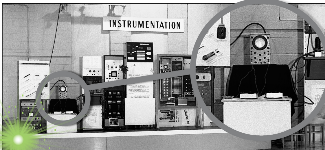
William Higinbotham's Tennis for Two was played on a five-inch oscilloscope screen at the Visitors' Day Instrumentation Division exhibit. Many recall lines of people wrapped around Brookhaven's gymnasium waiting to play the game.

Before the era of electronic ping pong, hungry yellow dots, plumpers, mushrooms, and fireflowers, people waited in line to play video games at roller-skating rinks, arcades, and other hangouts. Fifty years ago, before either arcades or home video games, visitors waited in line at Brookhaven National Laboratory to play "Tennis for Two," an electronic tennis game that is unquestionably a forerunner of the modern video game.