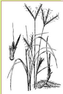
big bluestem, Andropogon gerardii Vitman