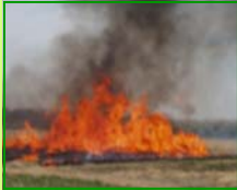
Spring Burning