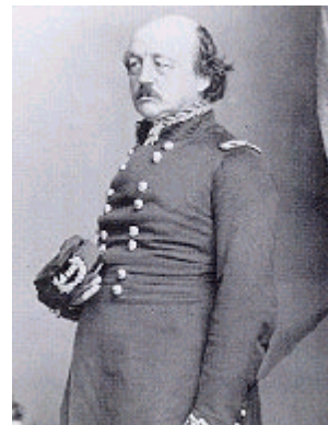
General Benjamin Butler

One of these figures was reportedly modeled after Benjamin F. Butler, a Civil War general, congressman, and later Governor of Massachusetts. The example in the Longfellow NHS collection bears a strong resemblance to Butler. The toy still has its original box, with a notation on the label indicating a price of "3.50," roughly equivalent to $62.00 today. Also printed on the box is the name of the toy's designer, Arthur E. Hotchkiss, and the patent date, 1875.